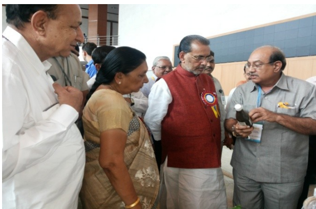
Hon. Union Min. of Agriculture, GoI Shri. Radha Mohan Singh visiting NAU stall

Directorate of Extension Education, NAU, Navsari exhibited stall during September 3-5, 2014 at Mahatma Mandir, Gandhinagar in which 7 University Officers and 9 Scientists participated in “Agri-tech Asia Exhibition-2014” and National Seminar at on “Farm Income Insurance Issues and Way forward on 04-09-2014. NAU technologies were exhibited in the exhibition. Shri Radha Monhanji, Hon. Union Minister of Agriculture, GoI and other dignitaries visited the exhibition.