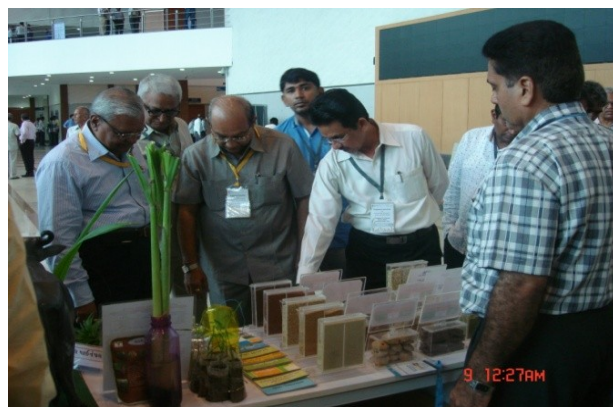
Dignitaries visiting the exhibition stall