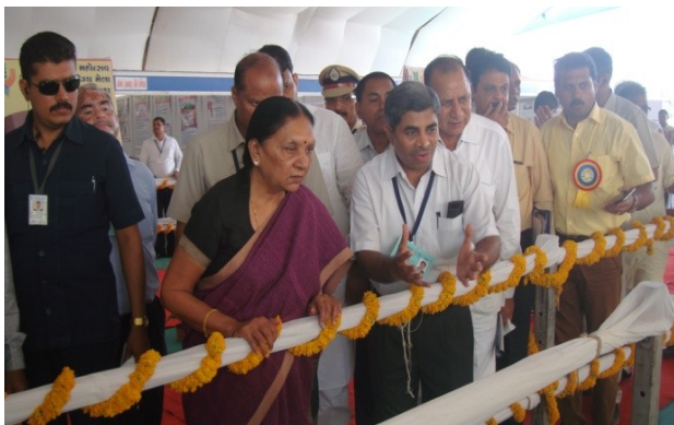
Hon. CM Smt. Anandiben Patel visiting Animal Health Fair

animal for different diseases. Chief Minister also discussed with the farmers, about 40000 farmers visited and participated in the fair.