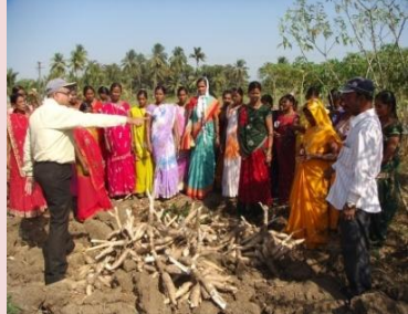
Training at Farmers' Field