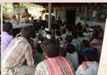
Interaction with farmers in Krishi Mahotsava an on/off-campus Training