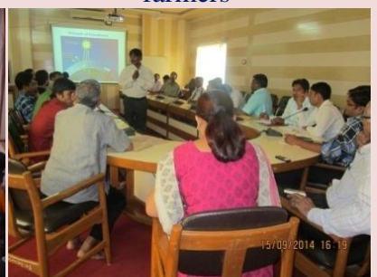
On Campus Training to Greenhouse Farmers