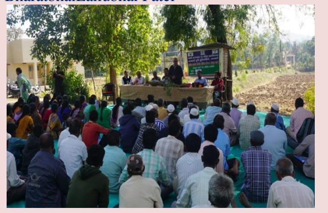
One day off campus framers training on Tuber One day off campus farmers training on Crops was arranged at Vanarasi