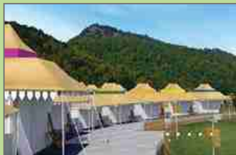
Statue of Unity and Tent City Narmada & Kevadia (175 km from Navsari)