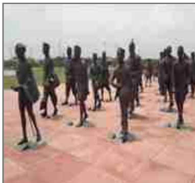
National Salt Satyagraha Memorial (UNESCO heritage site) Dandi (10 km from Navsari)