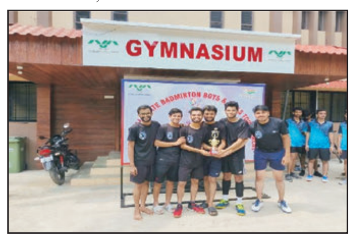
Boys team of College of Forestry secured first position in Inter college badminton tournament held at NAU, Navsari on October 11, 2022.