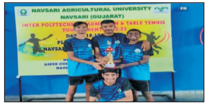
Boys team of Polytechnic in Agriculture, Bharuch

Boys team of Polytechnic in Agriculture, NAU, Bharuch Secured Runner up Position in NAU Inter polytechnic Chess Tournament 2022-23 held at Polytechnic in Agriculture, NAU, Vyara on October 17, 2022.