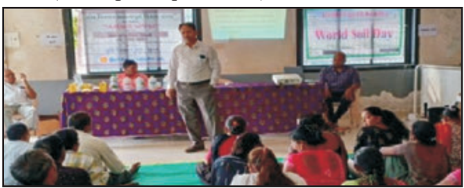
KVK, Surat and KVS-VS-NGO jointly celebrated 'World Soil Day' at village Damka, taluka- Choryasi, Dist.- Surat. (No. of participants: 70)