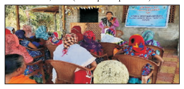
Training on "Nutrition management in mothers and children" at Amarkui Ta. Mangrol, Dist. Surat on December 29, 2022. (No. of participants: 24)