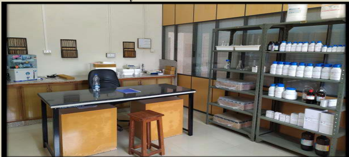
Media Preparation Room