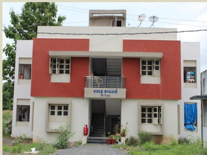
Newly constructed Staff Quarters