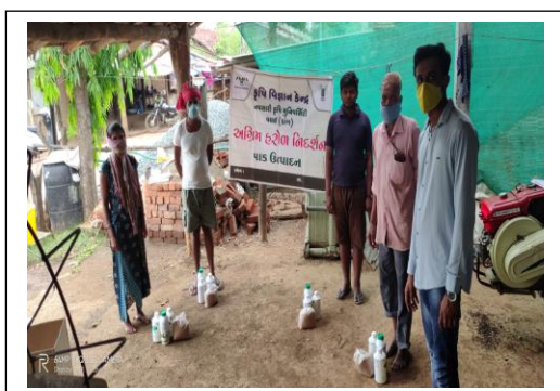
Seed, Biofertilizers and novel organic fertilizer distribution

As a result of intervention, the seed rate has been reduced to 25 kg/ha in SRI technic of paddy. Further due to SRI technic, the application of fertilizers, weeding and other interculturing operations were become easy for the farmers which in turn saved labour charges and increased family income which ultimately improved the standard of living of the farm family.