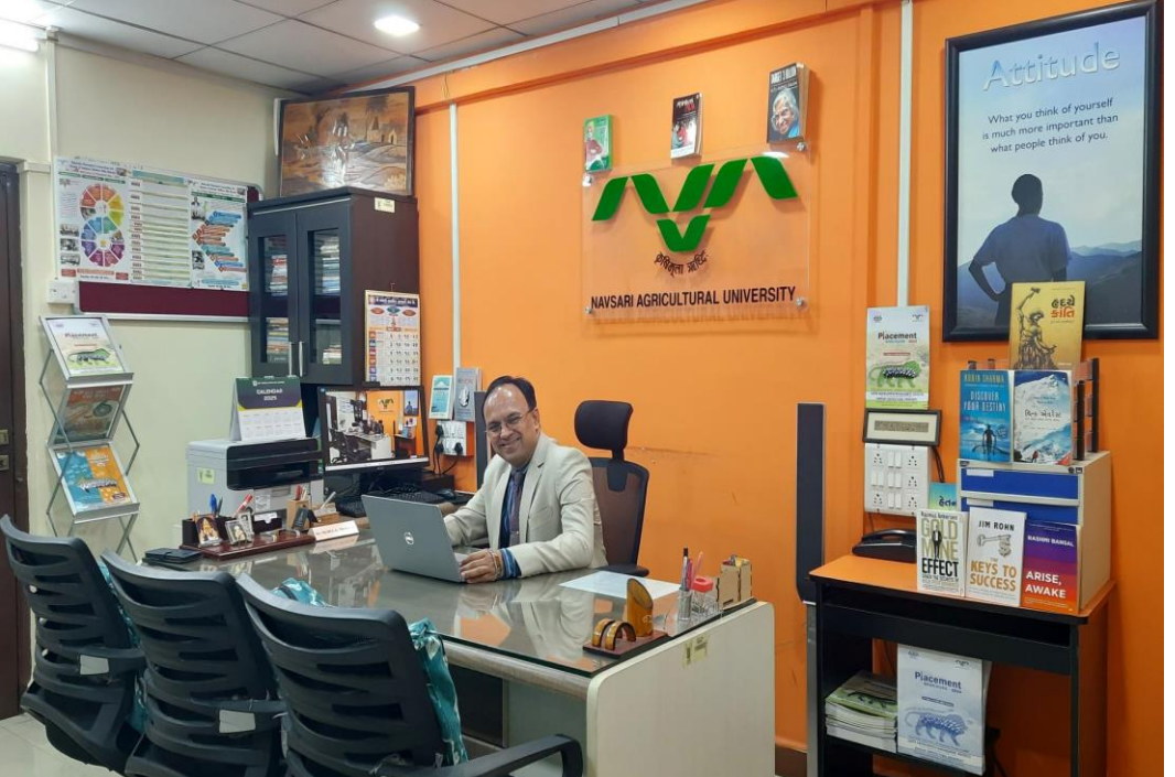
Come! Learn Today for a Better Tomorrow... Sometimes, Winning is Everything...