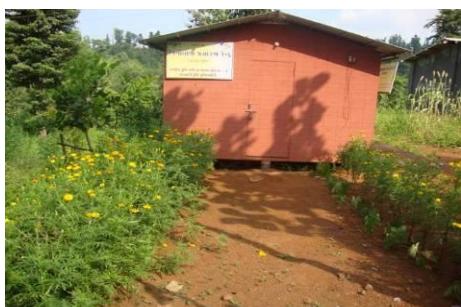
Technology Dissemination Center (TDC)