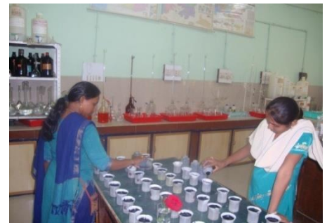
Soil Analysis in Laboratory