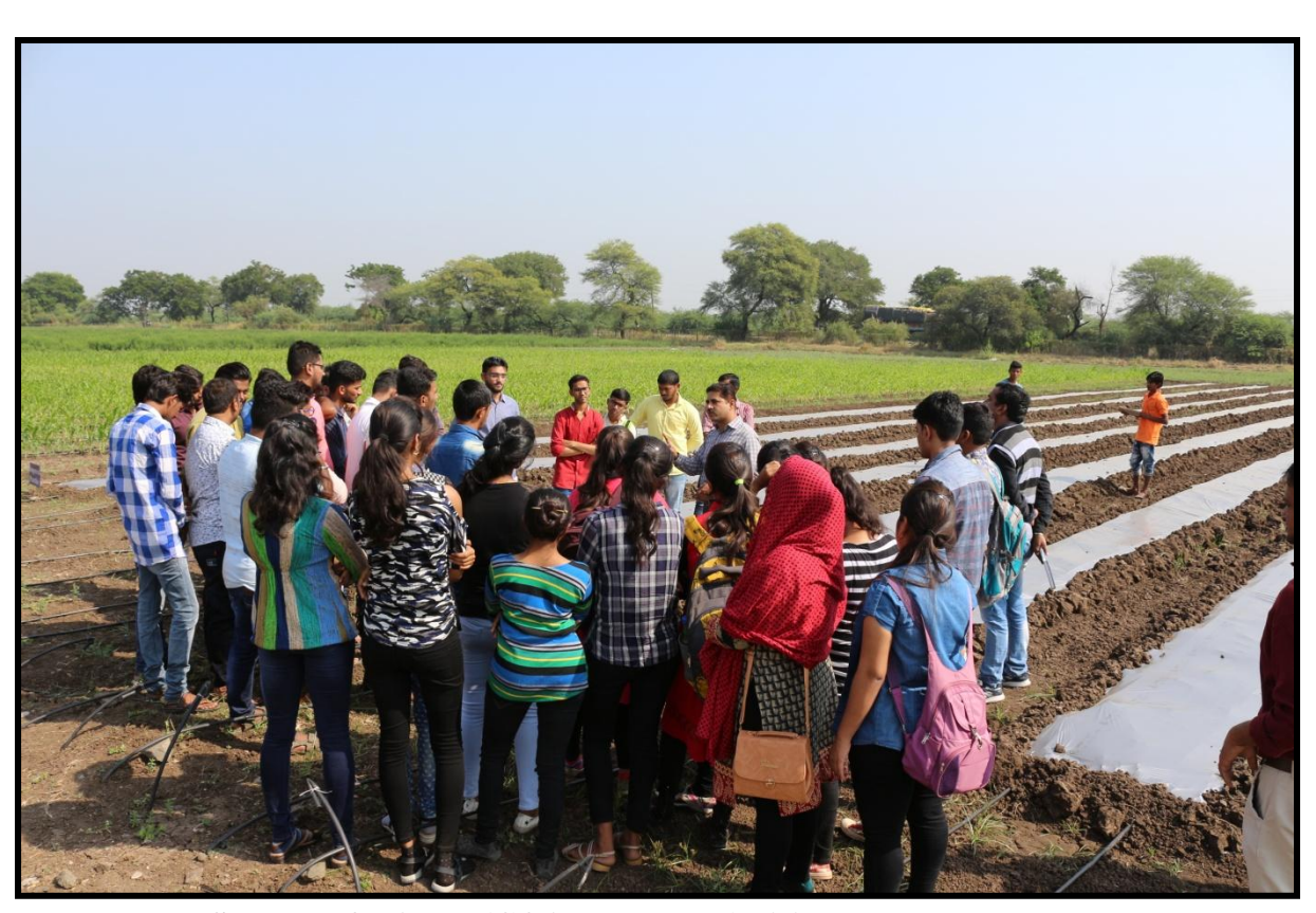
Student of RAWE (COAB, Bharuch) visited Tanchha center