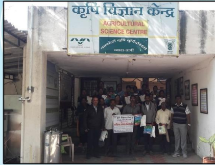
FLD ON BYPASS FAT