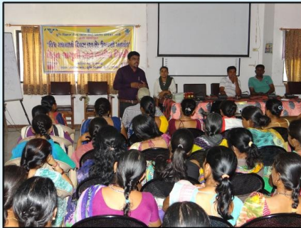
WORLD HONEYBEE DAY