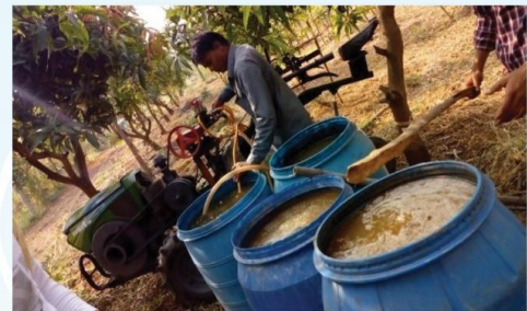
Organic Pesticides sprayed mechanically