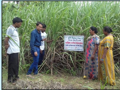
FLD ON SUGARCANE