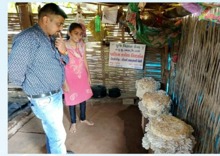
Post monitoring and tracking