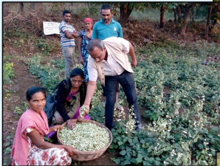
INDIAN BEAN CV. GNIB-21 READY FOR MARKETING