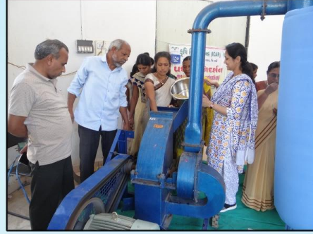
SCIENTIST VISIT TO FARMER'S FIELD