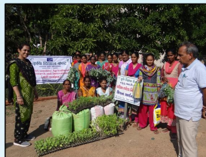
FLD KITCHEN GARDEN INPUT DISTRIBUTION