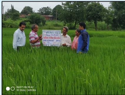
FLD ON PADDY