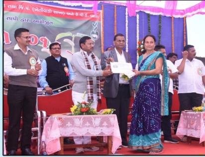
MAHILA DAIRY FARMER