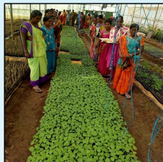
GOAT MAMANAGEMENT TRAINING