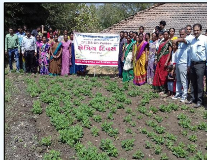
FIELD DAY ON GROUNDNUT