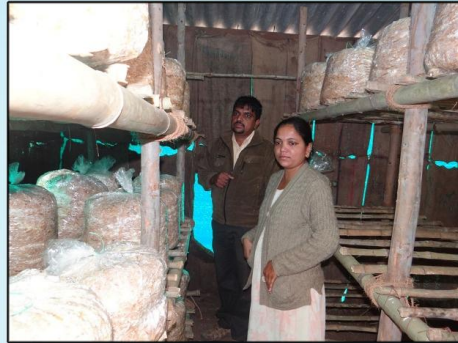
Monitoring visit of KVK Scientists