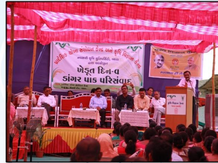
KHEDUT DIN - CUM - PADDY CROP SYMPOSIUM