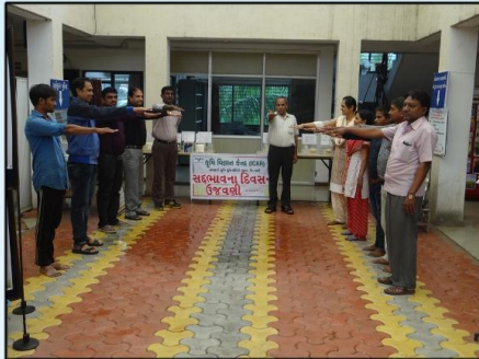
CELEBRATION OF SADBHAVNA DIVAS