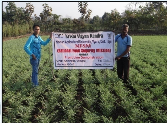
CROP CONDITION - CHICKPEA (GRAM) - VARIETY - GG-3