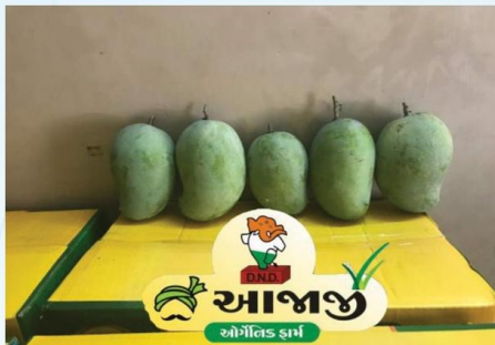
Packaging and Marketing of Mango