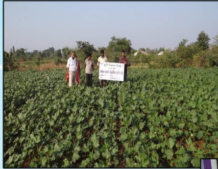
PLANT GEOMETRY IN OKRA