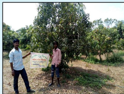
FLD ON MANGO