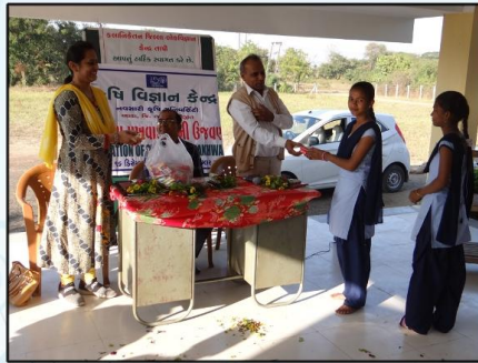
SOAP DISTRIBUTION TO STUDENTS