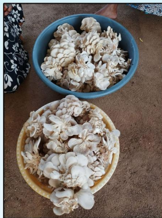
Harvested fresh mushroom