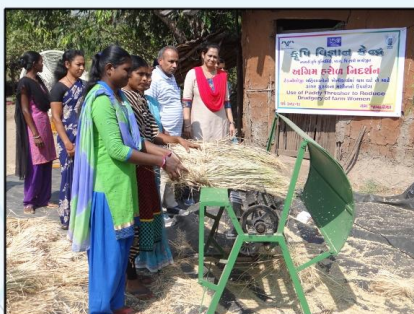
FLD-PADDY THRESHER-FLD VISIT