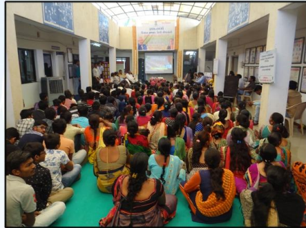
PM KISAN SAMMAN NIDHI YOJANA - WEBCAST