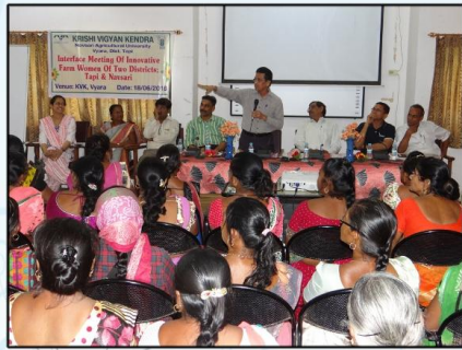
INTERFACE MEETING OF INNOVATIVE FARM WOMEN