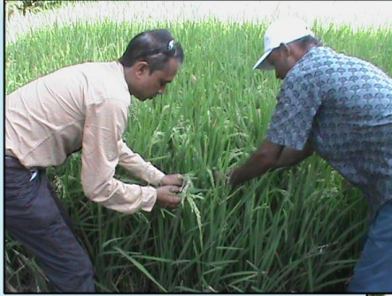
FIELD VISIT BY SCIENTIST