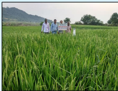
FLD ON IPDM IN PADDY