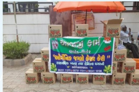
Selling Window of AAJAJI Organic Mango