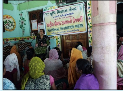
CELEBRATION OF NATIONAL NUTRITION WEEK