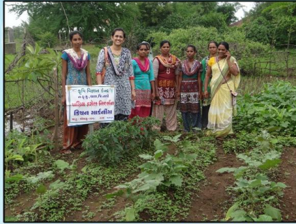
FLD ON KITCHEN GARDEN