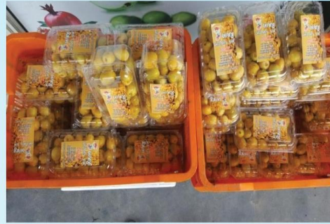
Packaging of Barhee Organic Date Palm