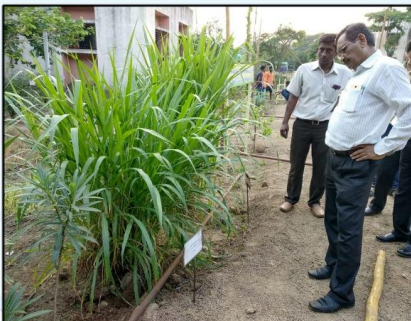
HON'BLE VC, NAU VISITED KVK