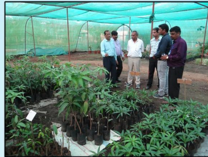
HON'BLE DIRECTOR - ATARI PUNE VISITED NURSERY