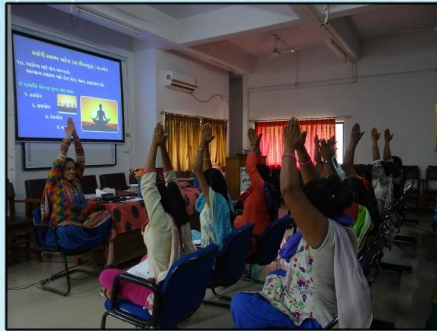
CELEBRATION OF INTERNATIONAL YOGA DAY