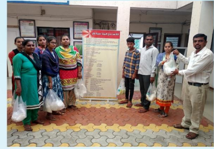
Method demonstration and kit distribution