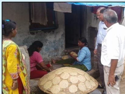
HON'BLE DIRECTOR - ATARI PUNE VISITED VALOD TO SEE THE TO SEE THE LIJJAT PAPAD UNIT