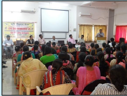
ONE DAY WORKSHOP ON MUSHROOM CULTIVATION