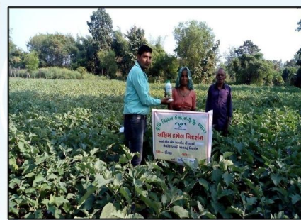
FLD ON BRINJAL