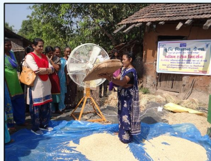
FLD ON WINNOWING FAN