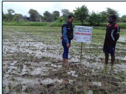
FLD ON PADDY