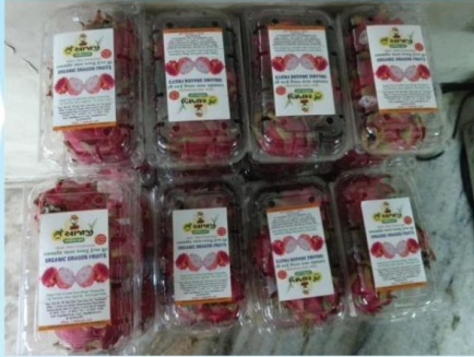
Packaging of Dragon Fruit