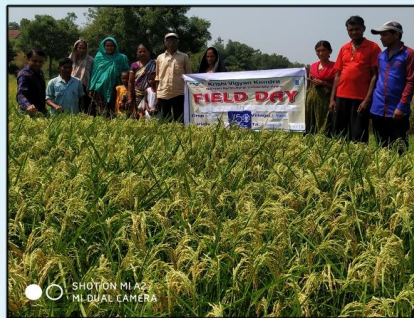
FIELD DAY ON PADDY