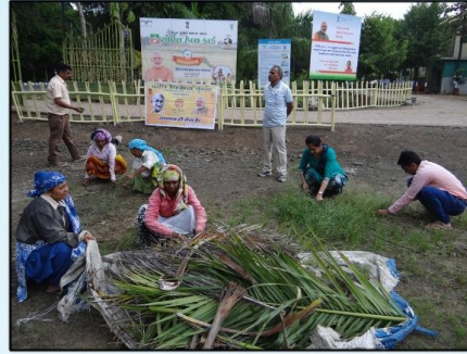
CLEANING OF OFFICE CAMPUS