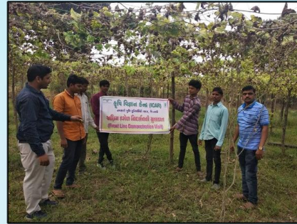
FLD ON LITTLE GOURD