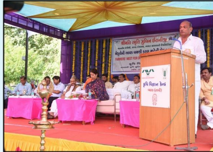
SPEECH BY HON'BLE AGRIL. MINISTER (STATE), GOG, SHRI JAYDRATHSINH PARMAR