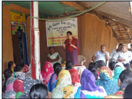
CELEBRATION OF WOMEN IN AGRICULTURE DAY