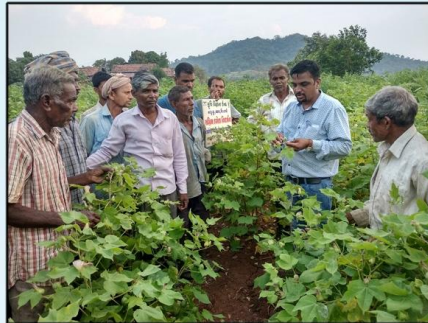
FLD ON COTTON