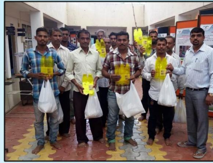
FLD ON BRINJAL (IPDM)