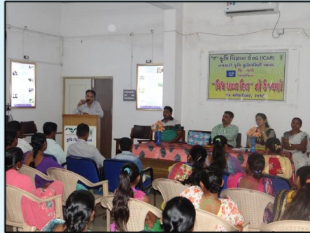
WORLD FOOD DAY