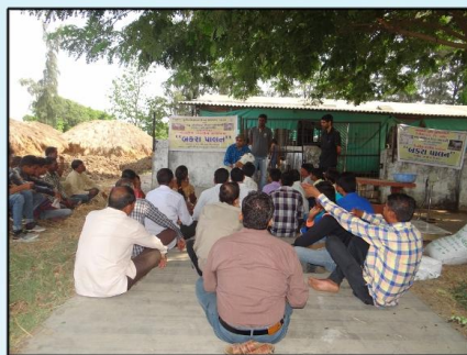
GOAT MANAGEMENT TRAINING