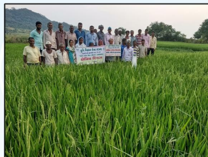
FIELD DAY ON IPDM IN PADDY