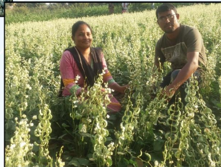
INNOCENCE IN SMILESTRIVE SEEN IN PERFORMANCE OF INDIAN BEAN CV. GNIB-21