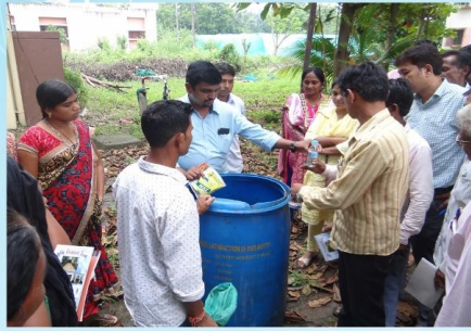
On Campus training programme