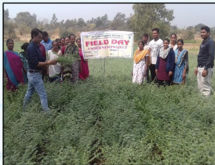
FIELD DAY ON CHICKPEA