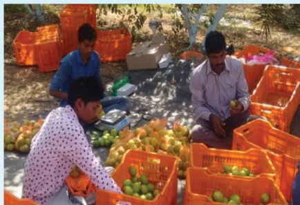
Grading and packaging of apple ber