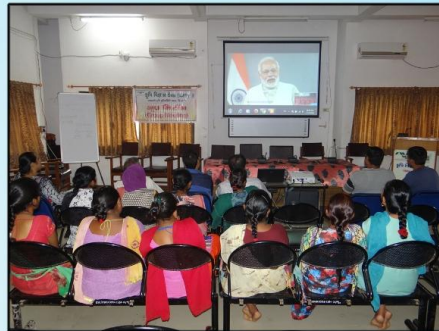
INTERACTION WITH HON PM