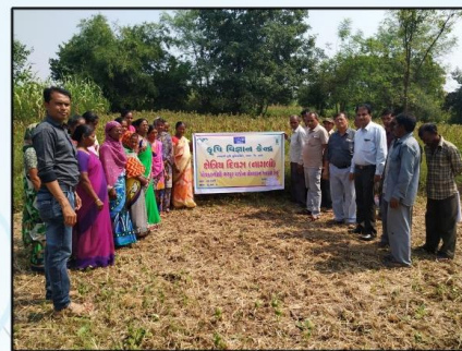
FIELD DAY - NAGLI