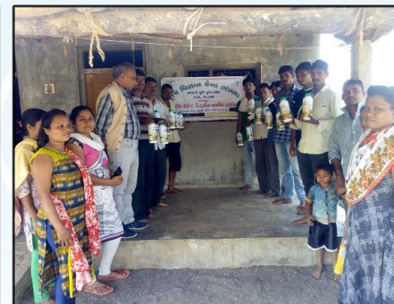
FLD INPUT DISTRIBUTION FOR EFFECT OF NOLN IN LITTLE GOURD