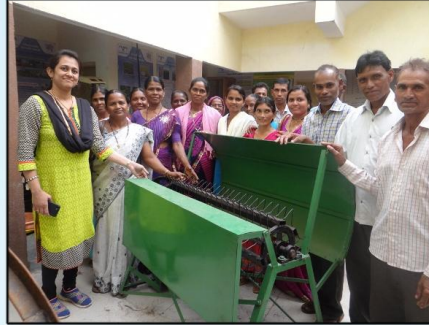
FLD ON PADDY THRESHER