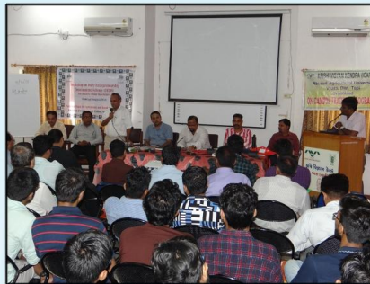
DAIRY WORKSHOP BY NABARD