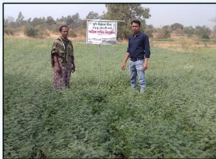
FLD ON GRAM