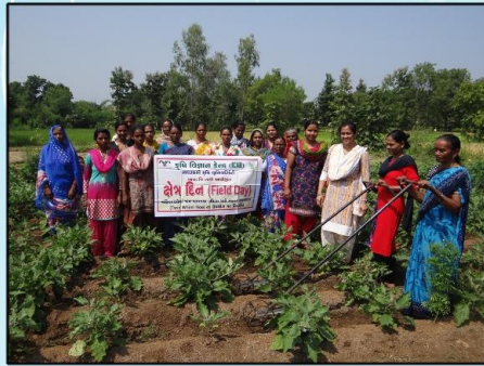
FIELD DAY ON TWIN WHEEL HOE WEEDER