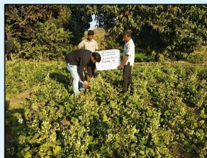
FLD ON INDIAN BEAN - GNIB-22