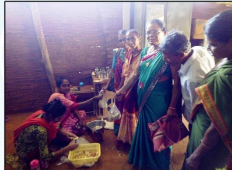
Retail market of mushroom in small packets