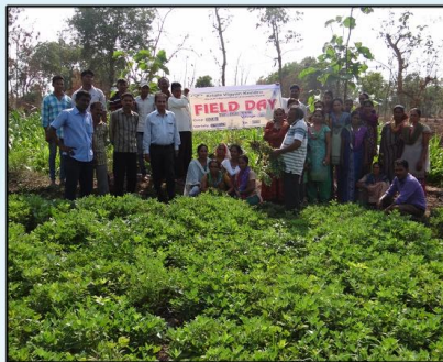
FIELD DAY ON GROUNDNUT-TAG 37 A