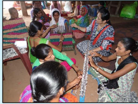
TRAINING ON RURAL CRAFTS