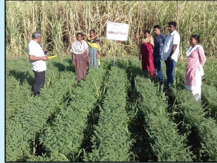
FLD VISIT ON CHICKPEA