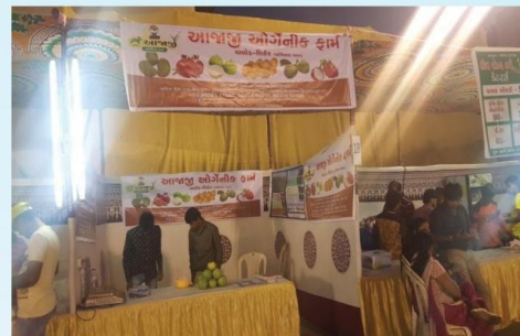
Selling of 1kg guava in Fair