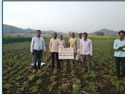
FLD-IPDM IN GRAM