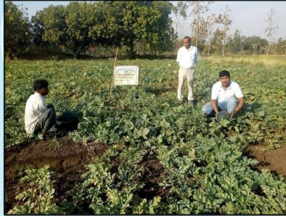
FLD ON WATERMELON