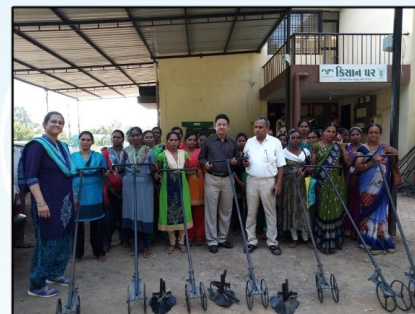
FLD-TWIN WHEEL HOE WEEDER INPUT DISTRIBUTION