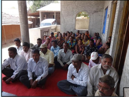
BENEFICIARIES AT BEDI ON FIELD DAY ON GROUNDNUT