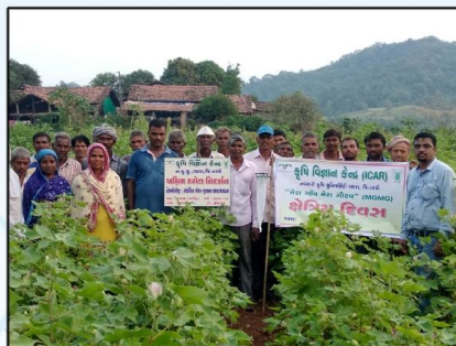
FIELD DAY ON IPDM IN COTTON