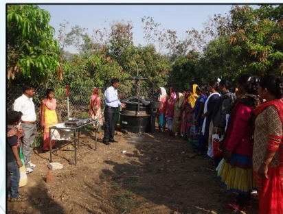
DEMONSTRATION UNIT VISIT