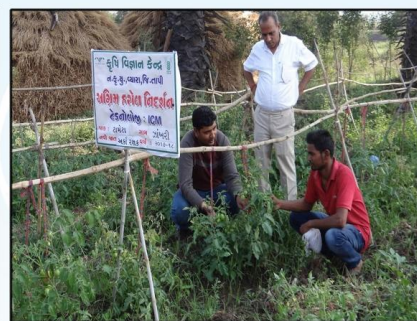
FLD ON TOMATO