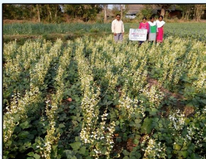
FLD ON INDIAN BEAN - GNIB-21