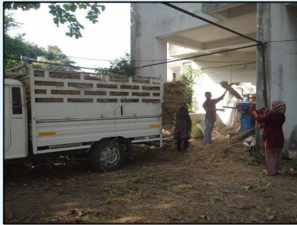
KVK, Tapi Co-operate to Anjanaben for paddy straw cutting