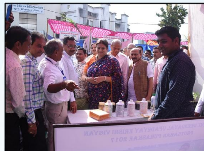
DIGNITARIES VISITING THE EXHIBITION