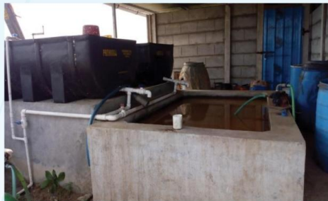
Jeevamrut and waste decomposer Preparation Unit attached with Fertigation Unit