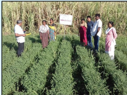
FLD ON CHICKPEA