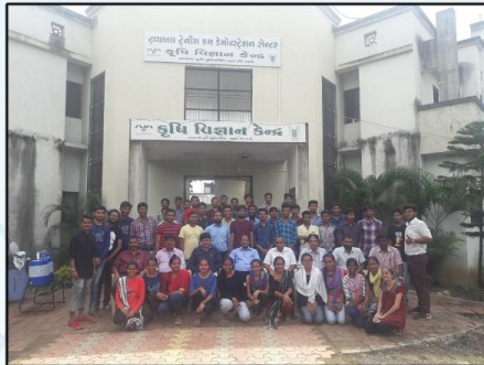
FIELD DAY - NAGLI