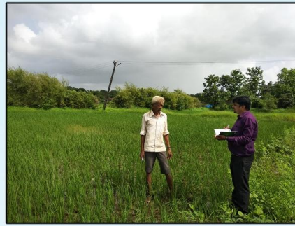
FARMERS - SCIENTIST INTERACTION