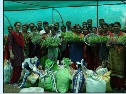
FLD ON KITCHEN GARDEN