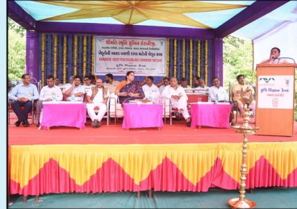
SPEECH BY HON'BLE MP - BARDOLI SHRI PRABHUBHAI VASAVA