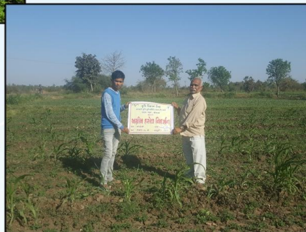
FLD ON GROUNDNUT-TAG 37 A