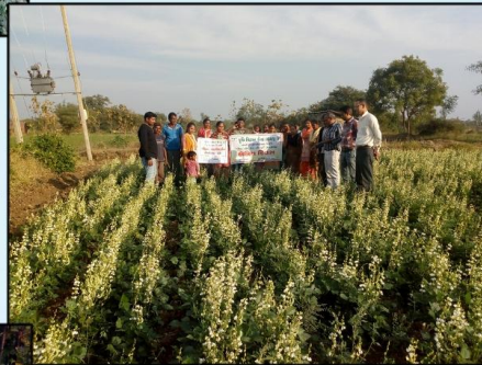
FIELD DAY -INDIAN BEAN CV. GNIB-21