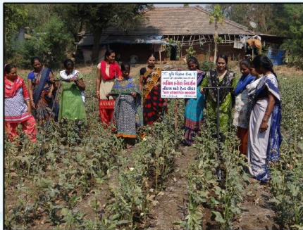
FLD ON TWIN WHEEL HOE WEEDER