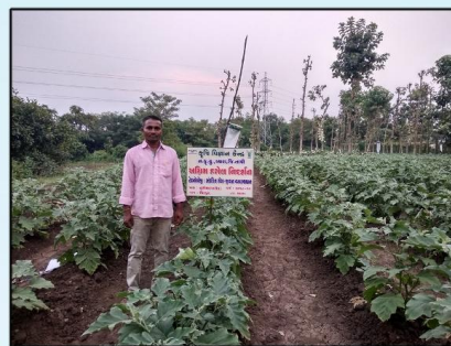
FLD ON IPDM IN BRINJAL