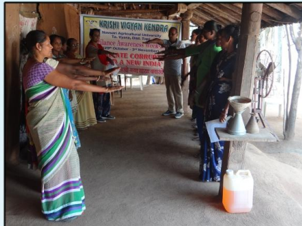
CELEBRATION OF VIGILANCE AWARENESS WEEK