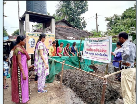
TRAINING ON VERMI-COMPOST PREPARATION