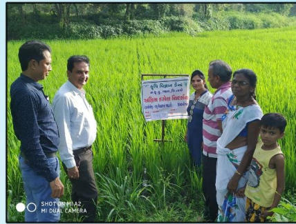
FLD ON PADDY