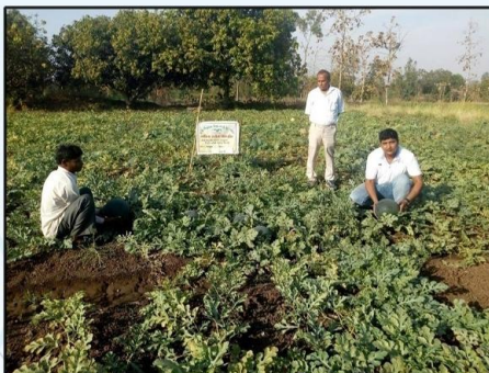
FLD EFFECT OF NOVEL ORGANIC LIQUID NUTRIENTS AND BIOFERTILIZERS IN WATERMELON