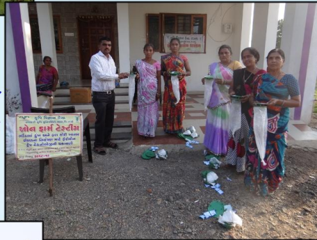
PHEROMON TRAP TECHNOLOGY IN OKRA