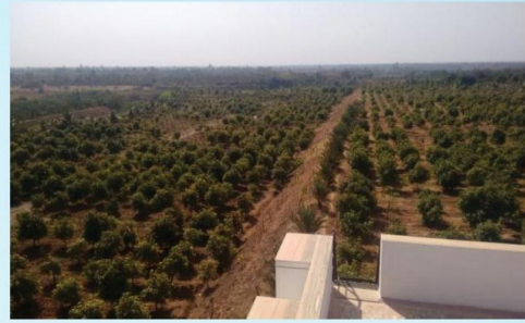
Overview of AAJAJI Organic Farm