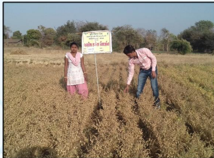
FLD ON GRAM