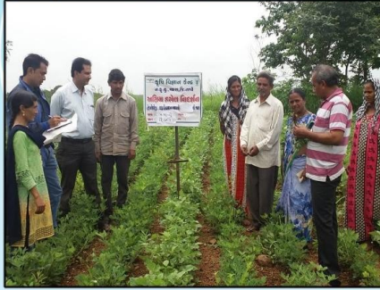
FLD ON GROUNDNUT