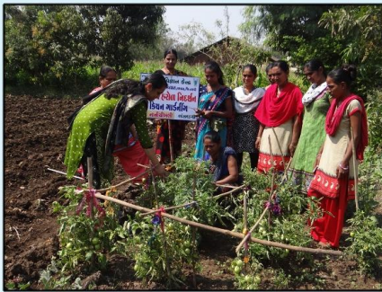
FLD ON KITCHEN GARDEN