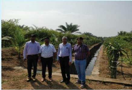
Director Horticulture Visited AAJAJI Farm