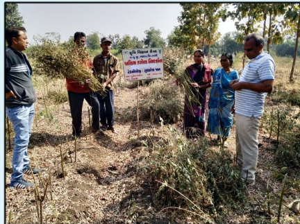
FLD VISIT ON PIGEONPEA