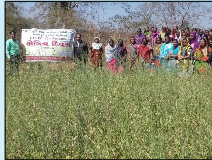
FIELD DAY ON MUSTARD