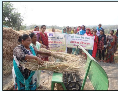
FIELD DAY ON PADDY THRESHER