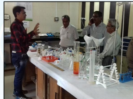
MAHILA SHIBIR ON MUSHROOM CULTIVATION