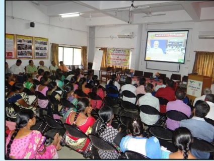
VIDEO CONFERENCE WITH HON. PM