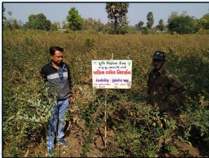
FLD ON PIGEON PEA