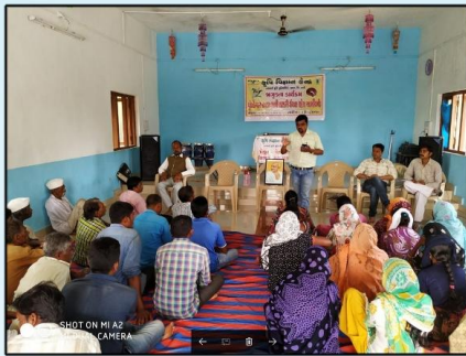
FALL ARMYWORM AWARENESS PROGRAMME