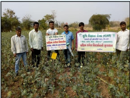
FLD VISIT ON IPDM IN OKRA