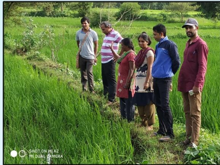
FLD VISIT ON PADDY