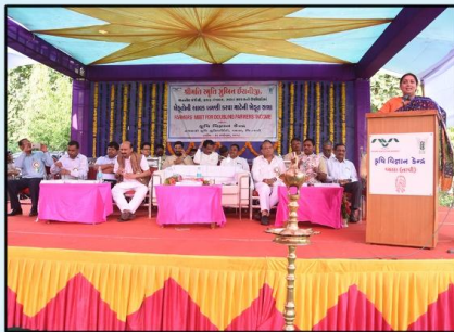
PRESIDENTIAL SPEECH BY HON'BLE MINISTER SMT. SMRUTI IRANIJI