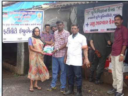
PASHU SARVAR CAMP