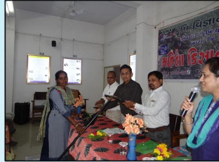
MAHILA KISAN DIVAS