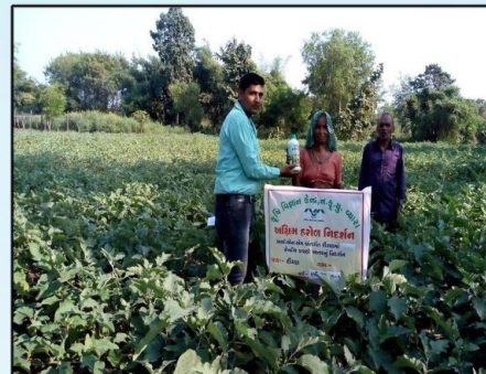
FLD EFFECT OF NOVEL ORGANIC LIQUID NUTRIENTS AND BIOFERTILIZERS IN BRINJAL