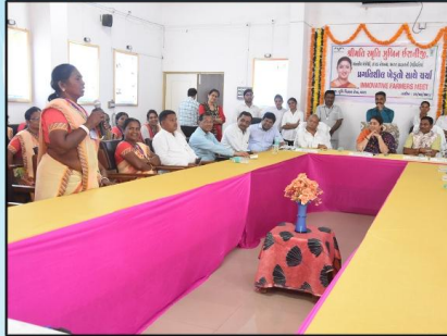
HON'BLE MINISTER (TEXTILE) SMT. SMRITI IRANIJI INTERACTED WITH FARMERS DURING HER VISIT