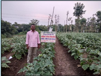
FLD-IPDM IN BRINJAL