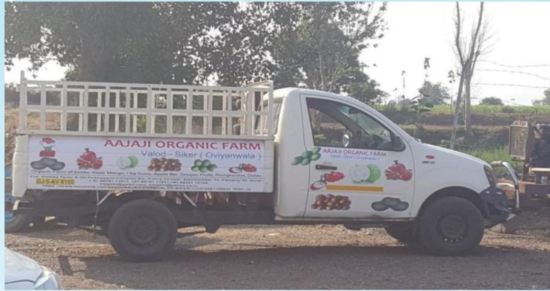
AAJAJI organic farm Vehicle for Marketing of their produce