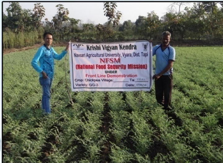
CROP CONDITION - CHICKPEA (GRAM) - VARIETY - GG-3