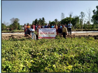
FIELD DAY ON MOONGBEAN