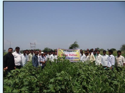
KHEDUT SHIBIR ON IPDM IN COTTON