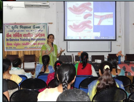
INSERVICE TRAINING ON ANEMIA AND ITS CONTROL MEASURES