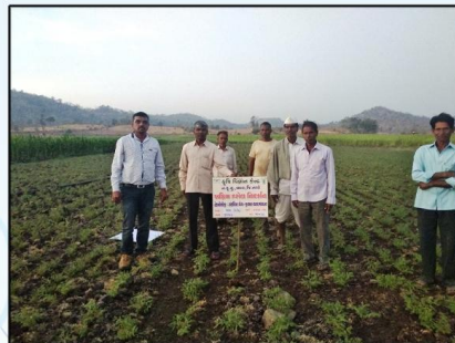
FLD ON IPDM IN GRAM