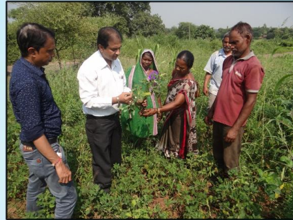
SCIENTIST VISIT TO FARMER'S FIELD