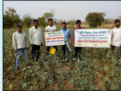
FLD ON IPDM IN OKRA