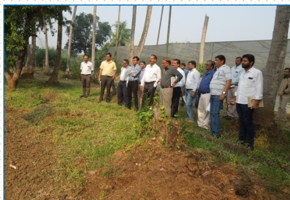
Trainees of ICAR sponsored Winter School