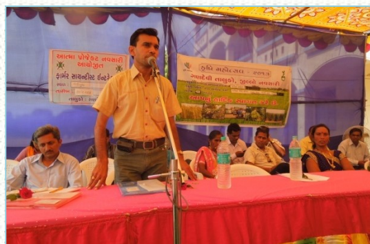
Krishi Mahosav 2013