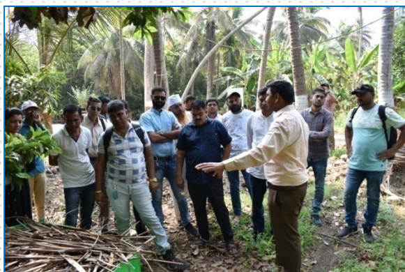
Exposure visit of farmers trainee