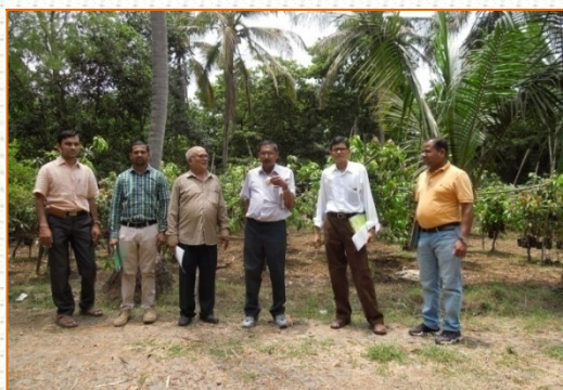
Assessment Team member for nursery accreditation under scheme of National Horticultural Board (2018)