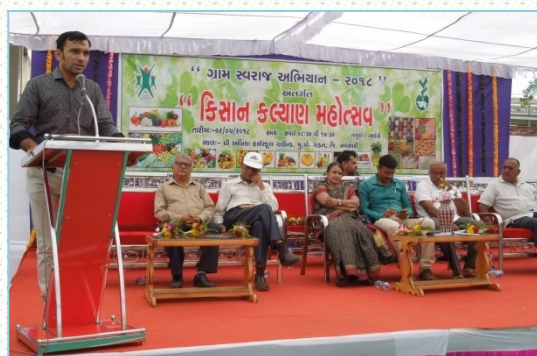
Krishi Mahosav 2018