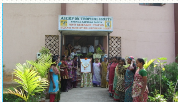
Swachhta Diwas (2 nd October, 2014)