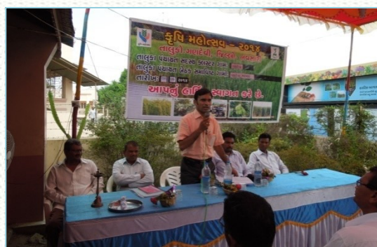
Krishi Mahosav 2014