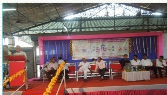
Krishi Mahosav 2019