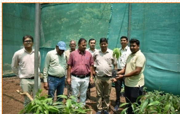
Assessment Team Members for nursery accreditation under scheme of NHB (2023)