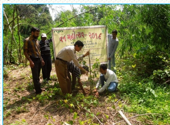
Van Mahotsav (July, 2019)