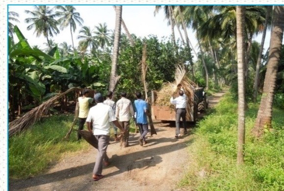
Swachhta Diwas Diwas (2 nd October, 2017)