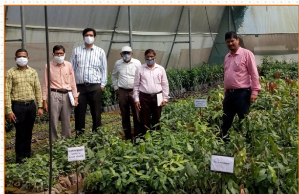
Assessment Team member for nursery accreditation under scheme of National Horticultural Board (2020)