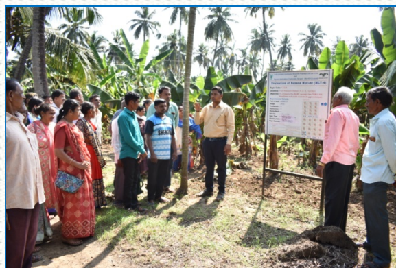
Exposure visit of farmers