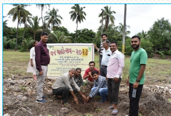
Van Mahotsav (July, 2023)