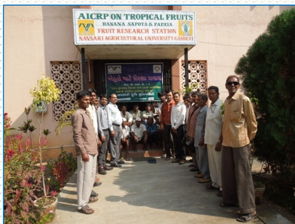
Exposure visit of farmers