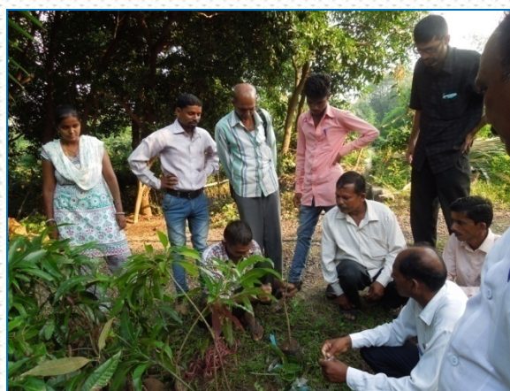
Exposure visit of farmers