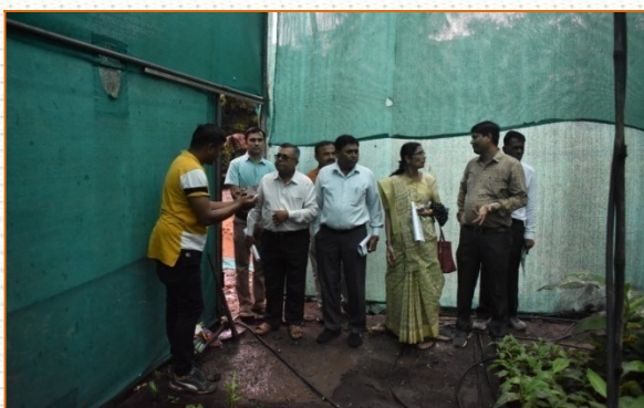
Members, Board of Management, NAU, Navsari