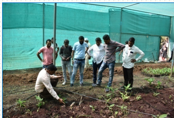
Visit of Swaminarayan Monk