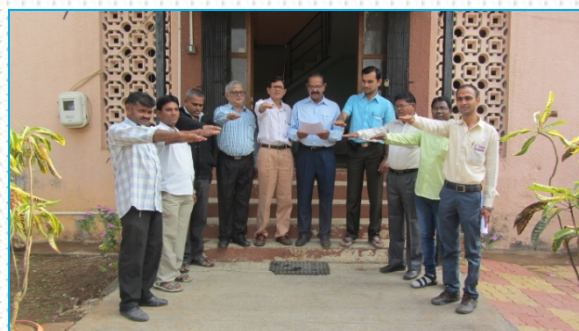
Election Shapath (January, 2017)