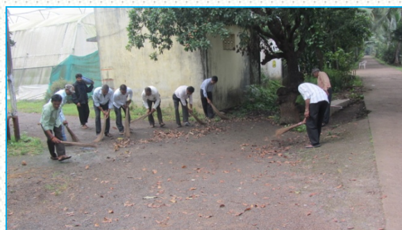
Swachhta Diwas (2 nd October, 2016)