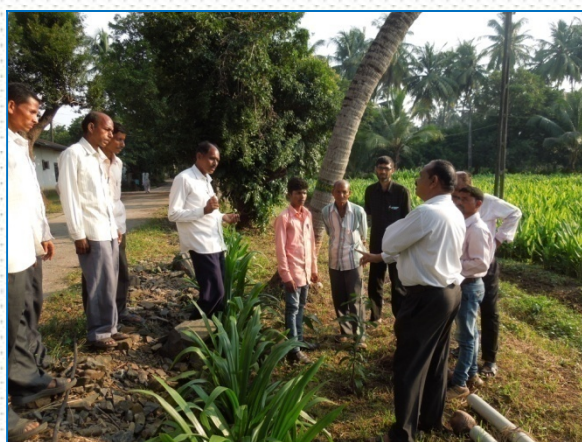
Exposure visit of farmers