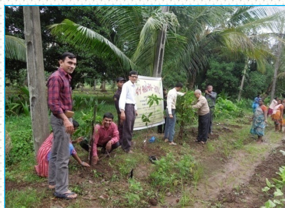
Van Mahotsav (July, 2018)