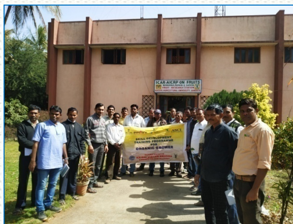
Exposure visit of farmers