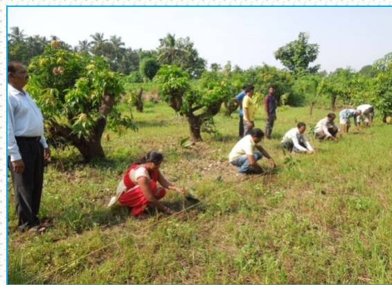
Van Mahotsav (July, 2017)