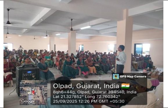
Training on Natural Farming to willing farmers of Olpad block under NMNF-2025 at Olpad Gin (Olpad) on September 25,2025 ( No.of Participants approx. 525)