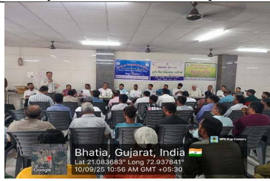
Sponsored training on Natural Farming in Sugarcane & Rabi Crops by District Panchayat-Surat at village Bhatia (Palsana) on September 10, 2025 ( No.of Participants 70)