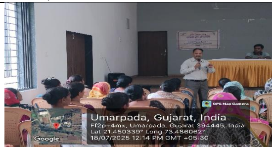
Training on Scientific Cultivation of Paddy & Pigeonpea and Awareness Programme on Natural Farming at Birsa Munda Hall (Umarpada) on July 18, 2025 ( No.of Participants 49)