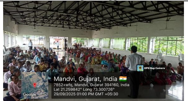
Training on Natural Farming to willing farmers of Mandvi block under NMNF-2025 at Krishi Mangal Hall (Mandvi) on September 29,2025 ( No.of Participants approx. 500)