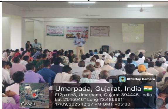
Training on Natural Farming to willing farmers of Umarpada block under NMNF-2025 at Birsa-munda Hall (Umarpada) on September 17,2025 ( No.of Participants approx. 400)