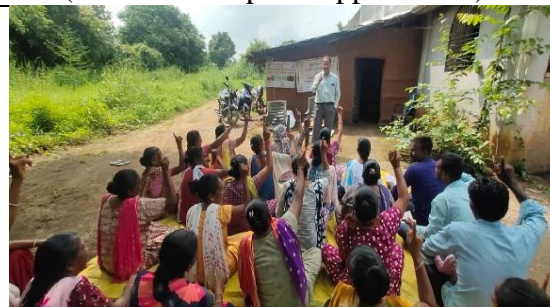
Training on Scientific Cultivation of Rabi-Sorghum and Awareness on Natural Farming at village Zarni (Mangrol) on September 18, 2025 ( No.of Participants 27)