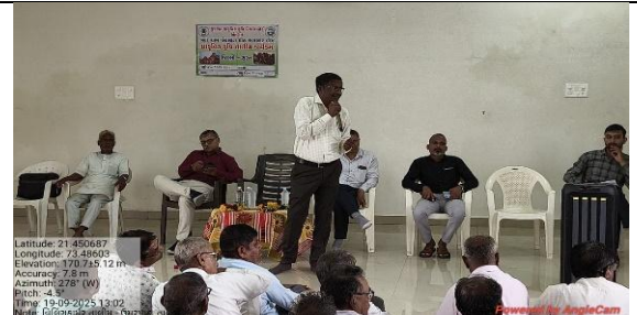
Training on Natural Farming to willing farmers of Umapada block under NMNF-2025 at Birsa-munda Hall (Umapada) on September 19,2025 ( No.of Participants approx. 225)