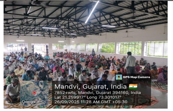
Training on Natural Farming to willing farmers of Mandvi block under NMNF-2025 at Krishi Mangal Hall (Mandvi) on September 26,2025 ( No.of Participants approx. 500)