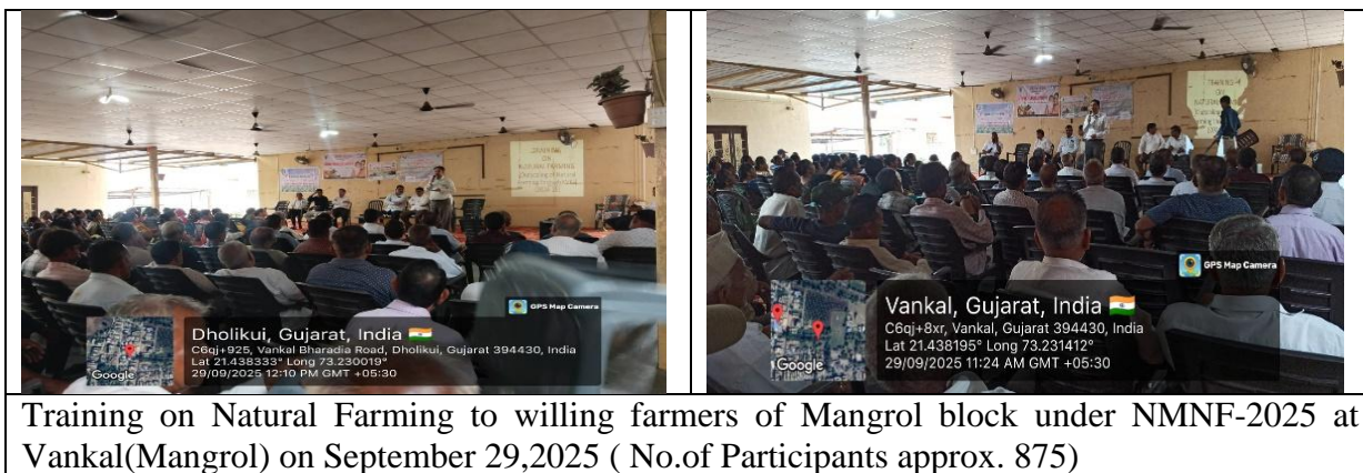
Training on Natural Farming to willing farmers of Mangrol block under NMNF-2025 at Vankal(Mangrol) on September 29,2025 ( No.of Participants approx. 875)

11. List of Superannuation/Retired of Faculties along with their designation: Nil.