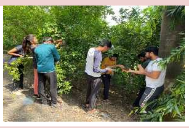
Air layering in Citrus