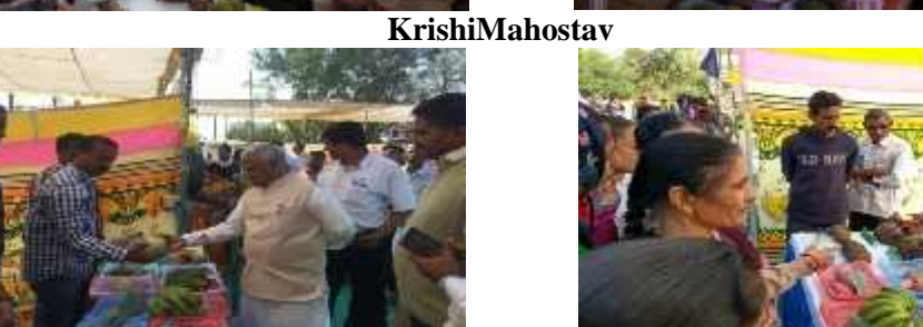
Agricultural Fair at Surkhai