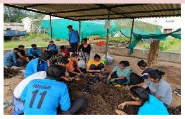
Preparing Drumstick Seedlings