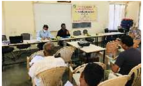
Lecture delivered at KVK Training