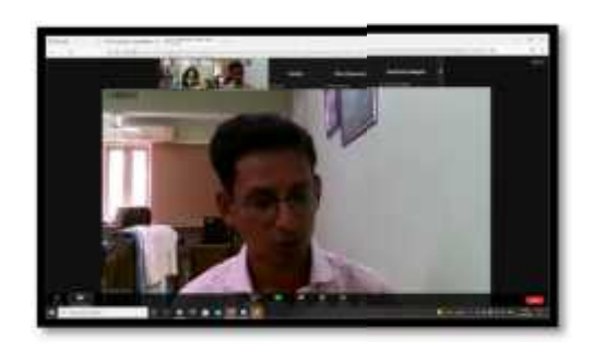
Lecture delivered in online workshoponHorticulture Nurseries: Scope and Technology