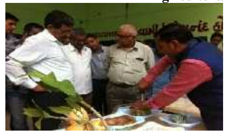
World Coconut Day 2<sup>nd</sup> September