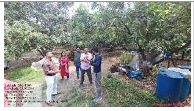
Diagnostic visit at farmer field