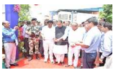
Horti Sangam 2016