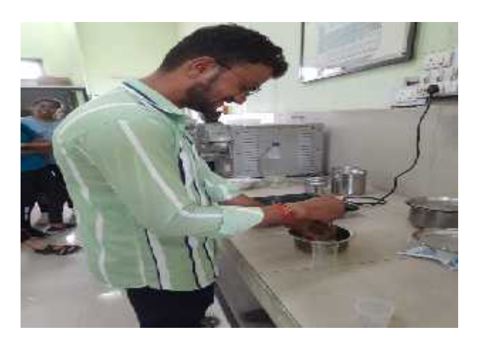
Preparation of Lanoline paste