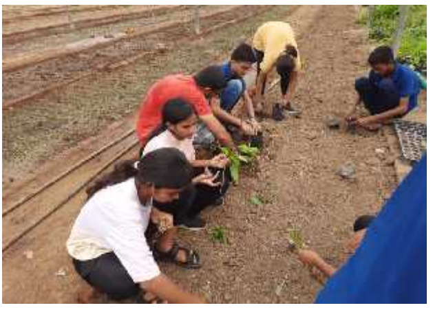
Preparing mango epicotyl grafting