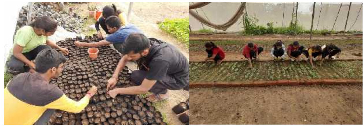
Sowing of Drumstick seeds