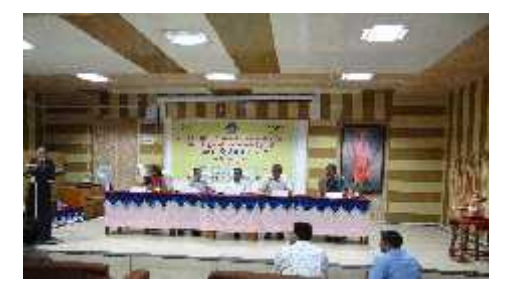
Lecture delivered in Mango chiku Shibir