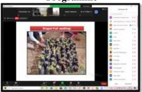
Lecture delivered in online workshoponHorticulture Nurseries: Scope and Technology