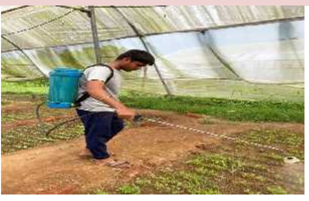
Insecticide spraying on vegetable seedlings