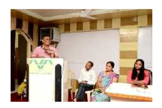
Lecture delivered in SSK, Navsari