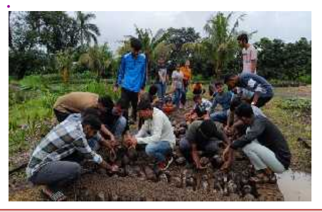
Sowing of Coconut seednut