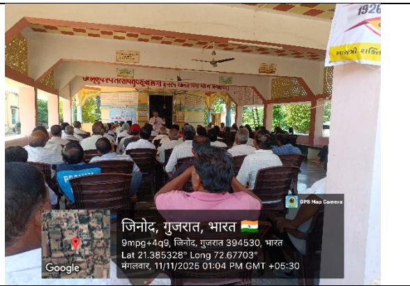
Guest Lecture on Natural Farming in a Training organized by WALMI-Surat at Jinod(Olpad) on November 11, 2025 ( No. of Participants 81).