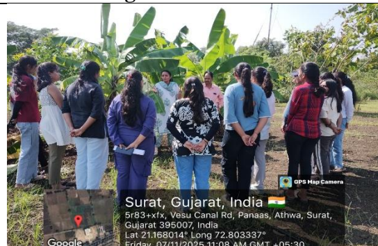
Awareness on Natural Farming and Visit of Natural farming model farm of RAWE Students of College of Agriculture, NAU, Waghai at KVK-Surat on November 07, 2025 ( No. of Participants 17).