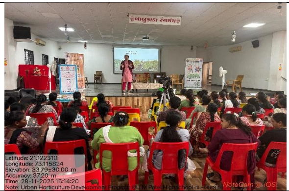
Participation in Sponsor training on Urban gardening at J. M. Desai school, Bardoli, Surat on November 28, 2025. Total 34 participants remained present.