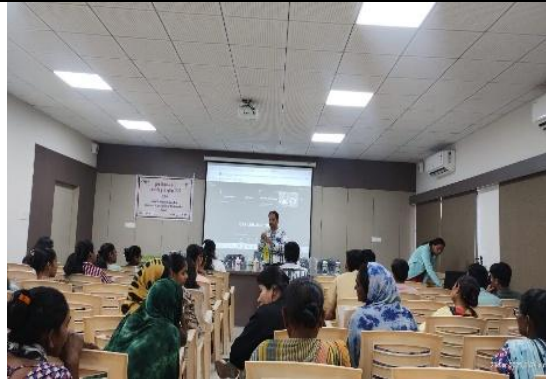
Lecture delivered on universities technologies during celebration of Kisan Diwas at KVK-Surat on December 23, 2025 ( No. of Participants 100).