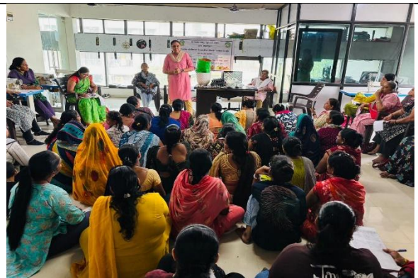
KVK, Surat and DDH, Surat jointly organized off-campus training on urban gardening at Jahagirpura, Surat on December 3, 2025. Total 46 participants actively present.