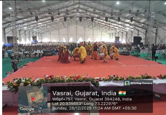
Guest Lecture delivered on Natural Farming in a Seminar organized by Dy. Director (Training),FTC-Bardoli, GPVB, ATMA-Surat and All Gujarat Tribal Society at Vasrai