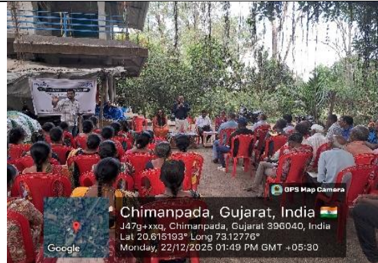
Awareness on Natural Farming to farmers in a Training organized by WALMI-Surat at Bahej (Navsari) on December 22, 2025 ( No. of Participants 83).