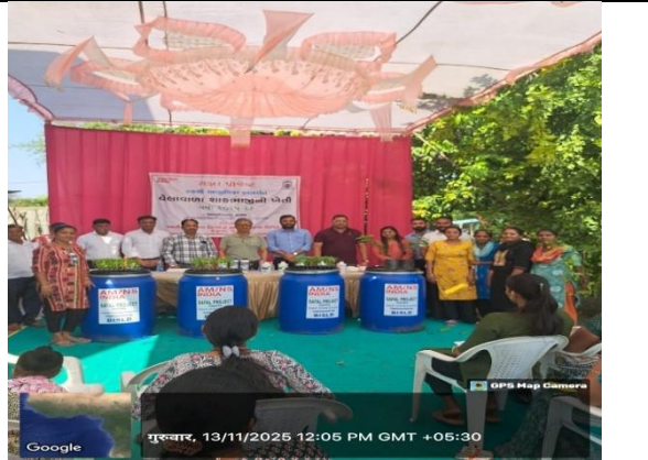
Awareness on Natural Farming in programme organized by BIAF-Surat at Rajagari (Choryasi) on November 13, 2025 ( No. of Participants 150).