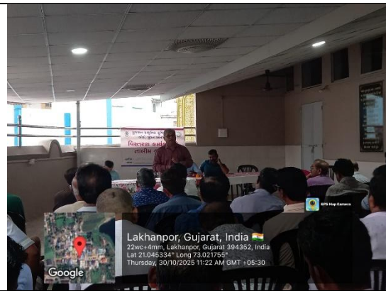
Sponsored In-Service Training on Natural Farming in Sugarcane at Lakhnapore (Palsana) on October 30, 2025 ( No.of Participants 74).