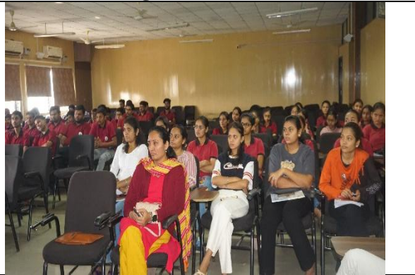
Guest Lecture on Natural Farming in a Training organized by COA, NAU, Bharuch on November 13, 2025 ( No. of Participants 97).