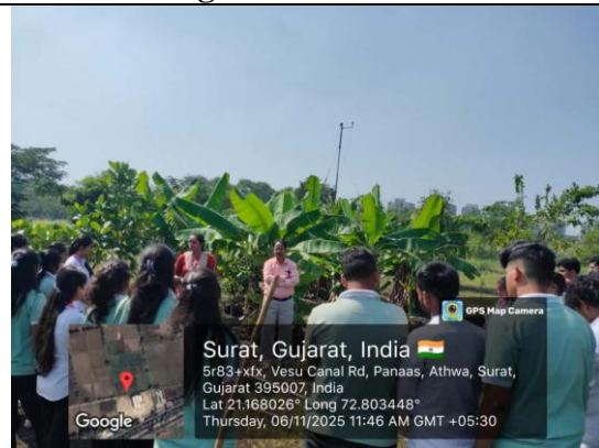
Awareness on Natural Farming and Visit of Natural farming Model farm of RAWE Students of Agriculture of Uka Tarsadia University, Bardoli at KVK-Surat on November 06, 2025 ( No. of Participants 32).