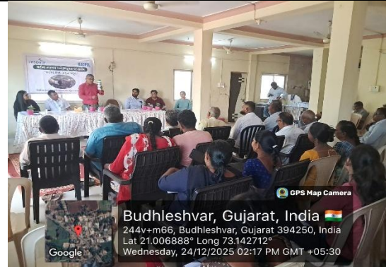
Awareness Programme on Natural Farming in a Training organized by WALMI-at Miyapur (Bardoli) on December 24, 2025 ( No.of Participants 51).