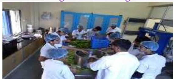
Aloe vera processing