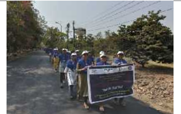
NSS Special Camp