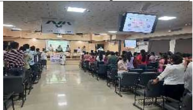
World No Tobacco Day