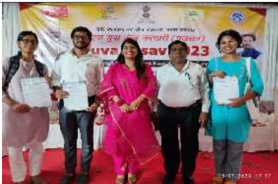
Nehru Yuva competition