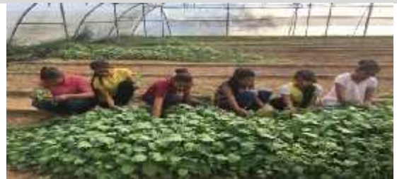
Practical learning in Students of ELP on marketing of vegetable seedlings