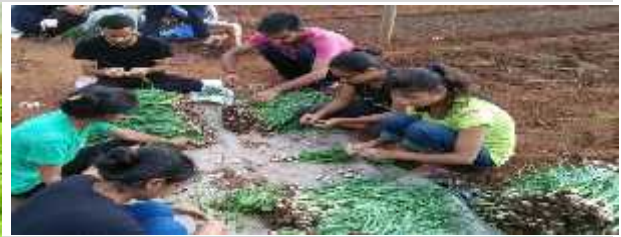
Harvesting, grading and packing of leafy vegetables