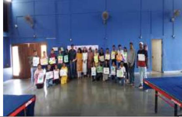
NAU, Foundation Day Celebration