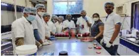
Preparation of Mix fruit jam