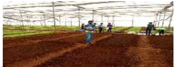
Cultivation of leafy vegetables under naturally ventilated polyhouse