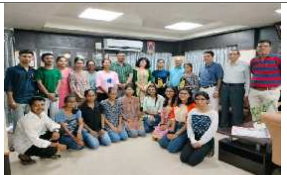
NSS Day Celebration