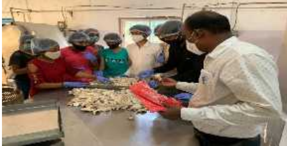
Preparation of mushroom for drying