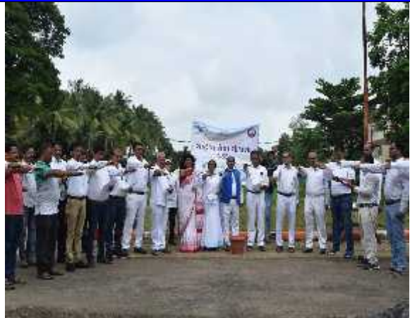
Tree Plantation Drive