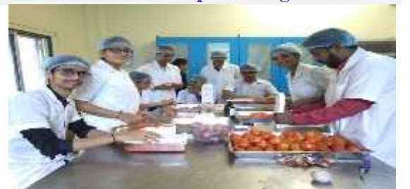
Tomato chutney preparation