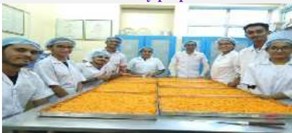
Carrot powder processing