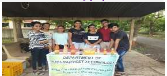
Marketing of Processed products