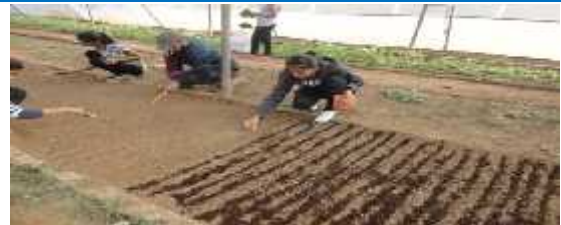
Exposure of students to Nursery raising techniques