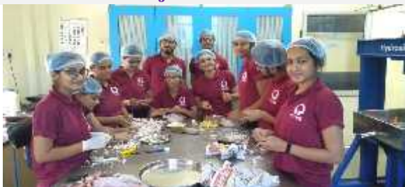
Onion chutney preparation