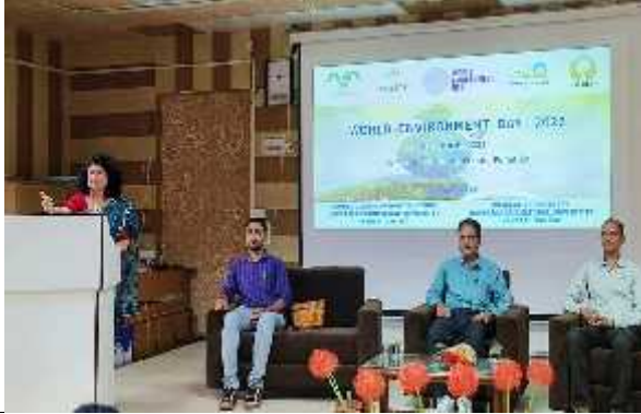
World Environment Day