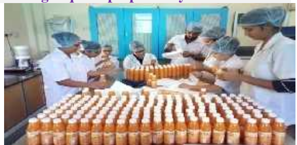
Mango nectar labelling