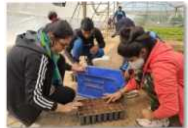
Sowing of aonla seeds in tray