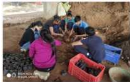
Filling of bags for sowing seeds and cuttings