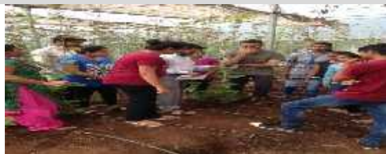
Training greater yam vertically under naturally ventilated polyhouse