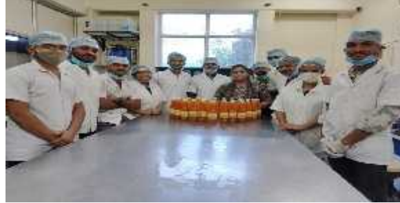
Mango squash prepared by ELP students