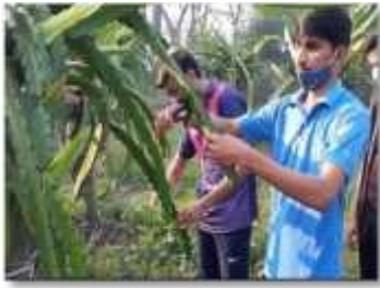
Dragon fruit cuttings