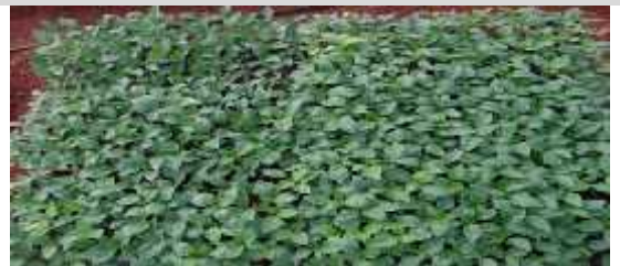
Practical learning in Students of ELP on plug-tray nursery raising