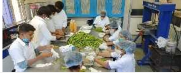
Preparation of peas for frozen