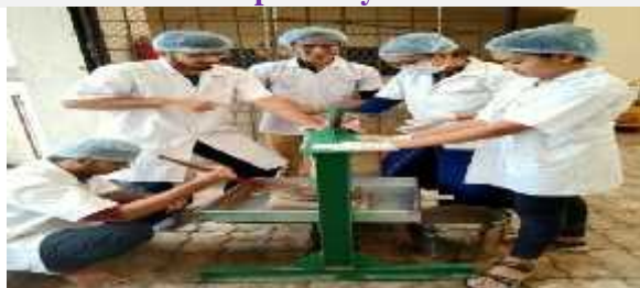
Noni juice extraction