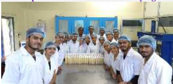
Guava Nectar Prepared by ELP Students