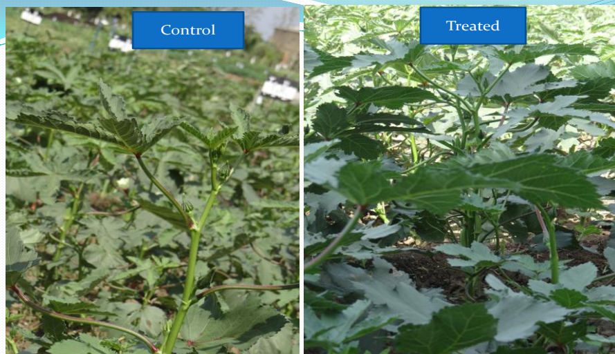
Effect of Foliar application of silicon on okra.