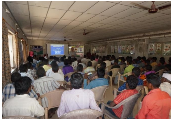
One day off campus farmers training on “Scientific cultivation method of sweet potato” under MIDH training programme at BAIF, Kaprala