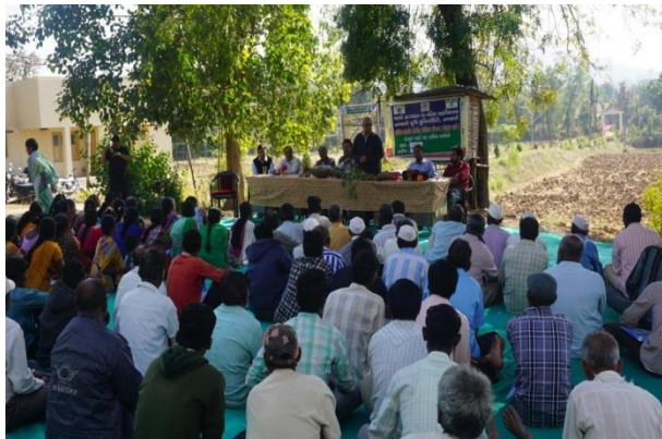
One day off campus farmers training on Tuber Crops was arranged at Vanarasi