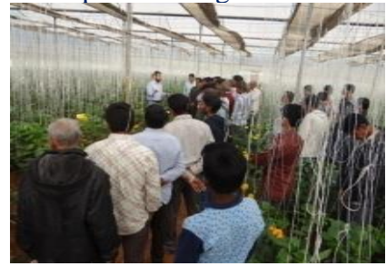
On Farm interaction with farmers