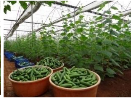
Training and pruning in cucumber under protected conditions