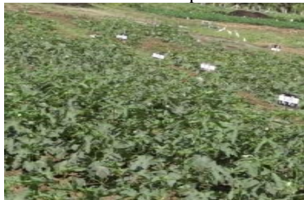
Pre. Hybrid Trial