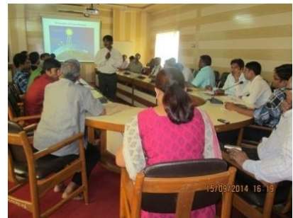
On Campus Training to Greenhouse Farmers