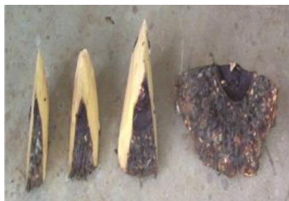
Miniset Technique for EFY