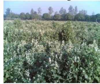
LSVT Indian bean