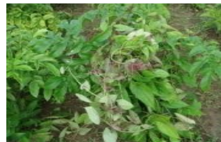
Live staking in Greater Yam