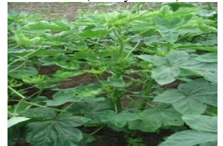
YVMV resistant AVT-I (Okra)