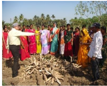
Training at Farmers' Field