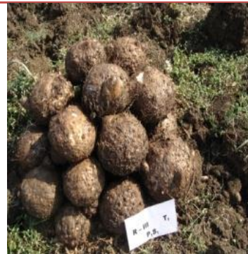
Yield from control sett