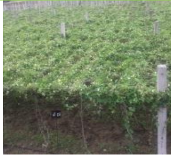
INM in Little gourd