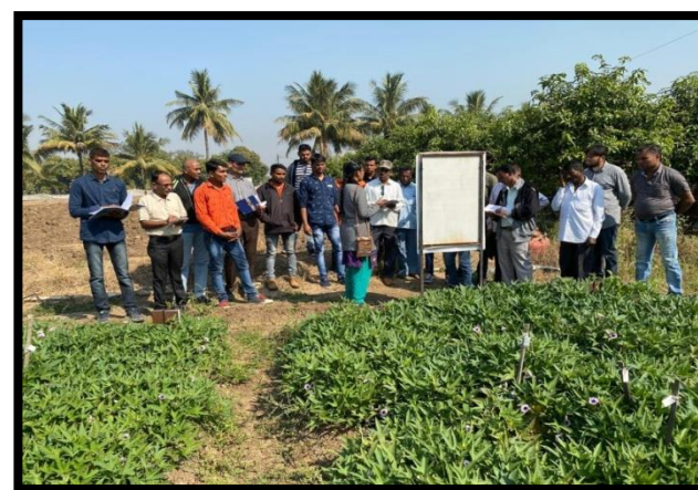
Educational tour of progressive farmers of Vil. Ambheti, Ta: Kaprada, Dis: Valsad at AICRP on Tuber Crops, Navsari