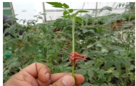
Grafting brinjal and tomato onto wild rootstock against biotic and abiotic stresses