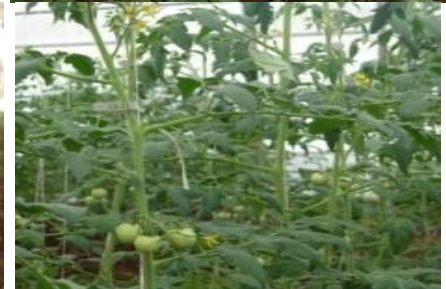
Use of pruned shoots for multiplication in cucumber and tomato: A new Approach to reduce cost of cultivation