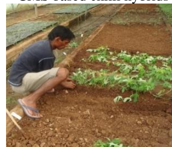
Secondary Nursery for sweet potato