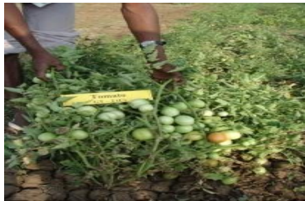
AVT-I (Det. type)