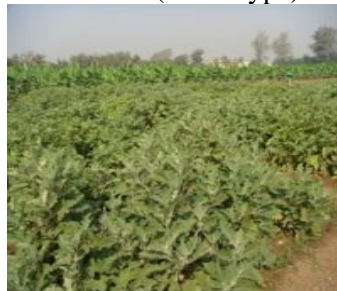
IET- Brinjal (Round)