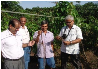
Diagnostic visit at farmers' field