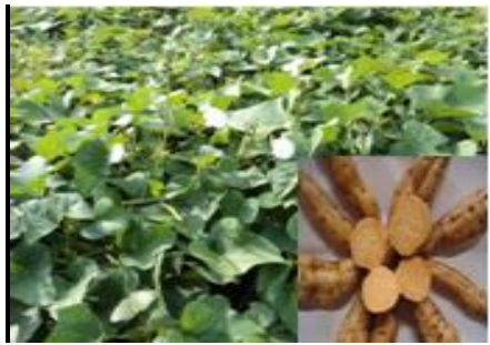
Cultivar Bhukanti in MLT