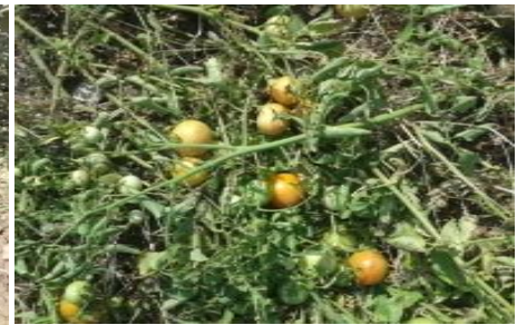
NTH-15-13 in LSHT