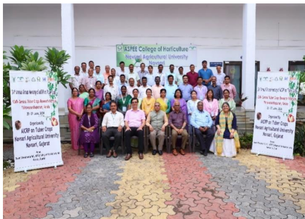
Organized 24th Annual Group Meeting of AICRP on Tuber Crops, NAU, Navsari, Gujarat Centre during 25 - 27 June, 2024 at Navsari Agricultural University, Navsari.