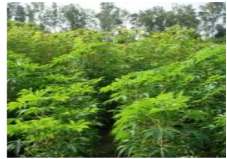
MLT on Cassava