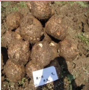
Yield from 250 g seed corm sett