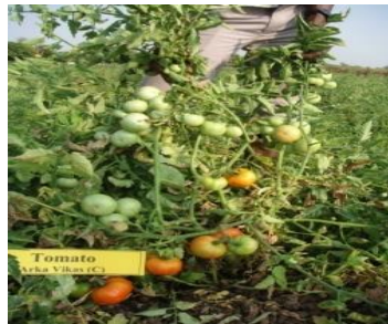
AVT-II (Indet. type)