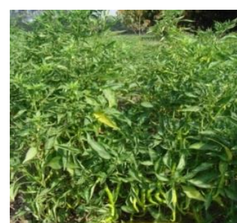
NCH -1603 in PHT