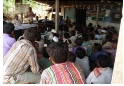
Interaction with farmers in Krishi Mahotsava an on/off-campus Training