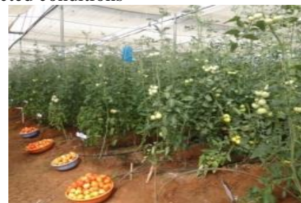
Training and pruning in tomato under protected conditions