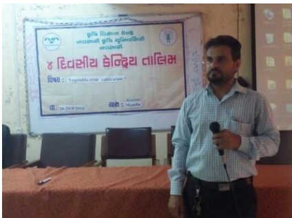
Lecture as resource person in farmers' training