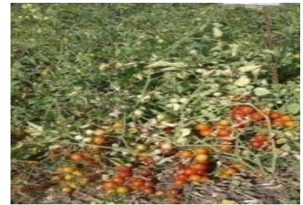
IET (Cherry tomato)