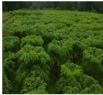
Organic cultivation of EFY