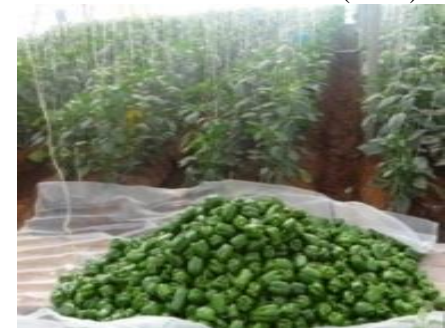
Training and pruning in capsicum under protected conditions