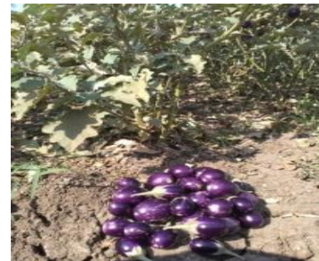
NBRH-14-01 in LSHT