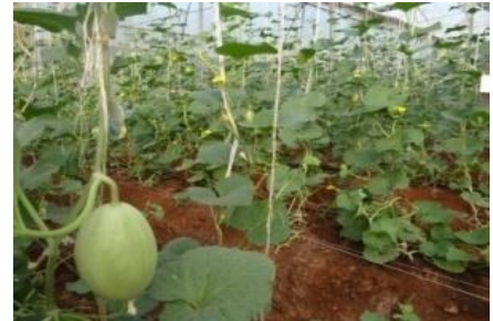
Training and artificial polination in muskmelon under protected conditions