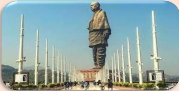
Statue of Unity (Kevdia)