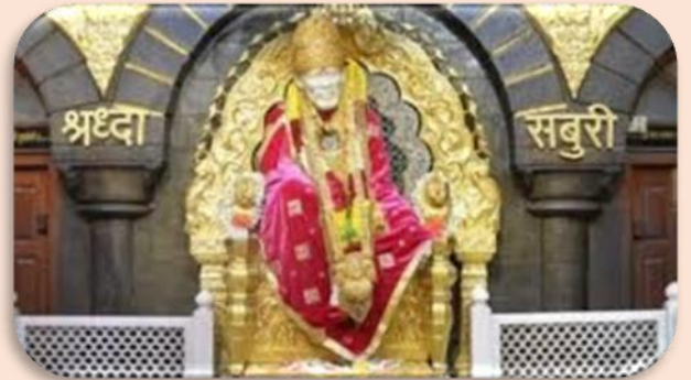
Sai Baba Temple (Shirdi)