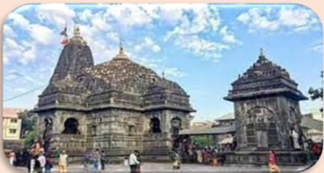
Trimbakeshwar Jyotirling Mandir