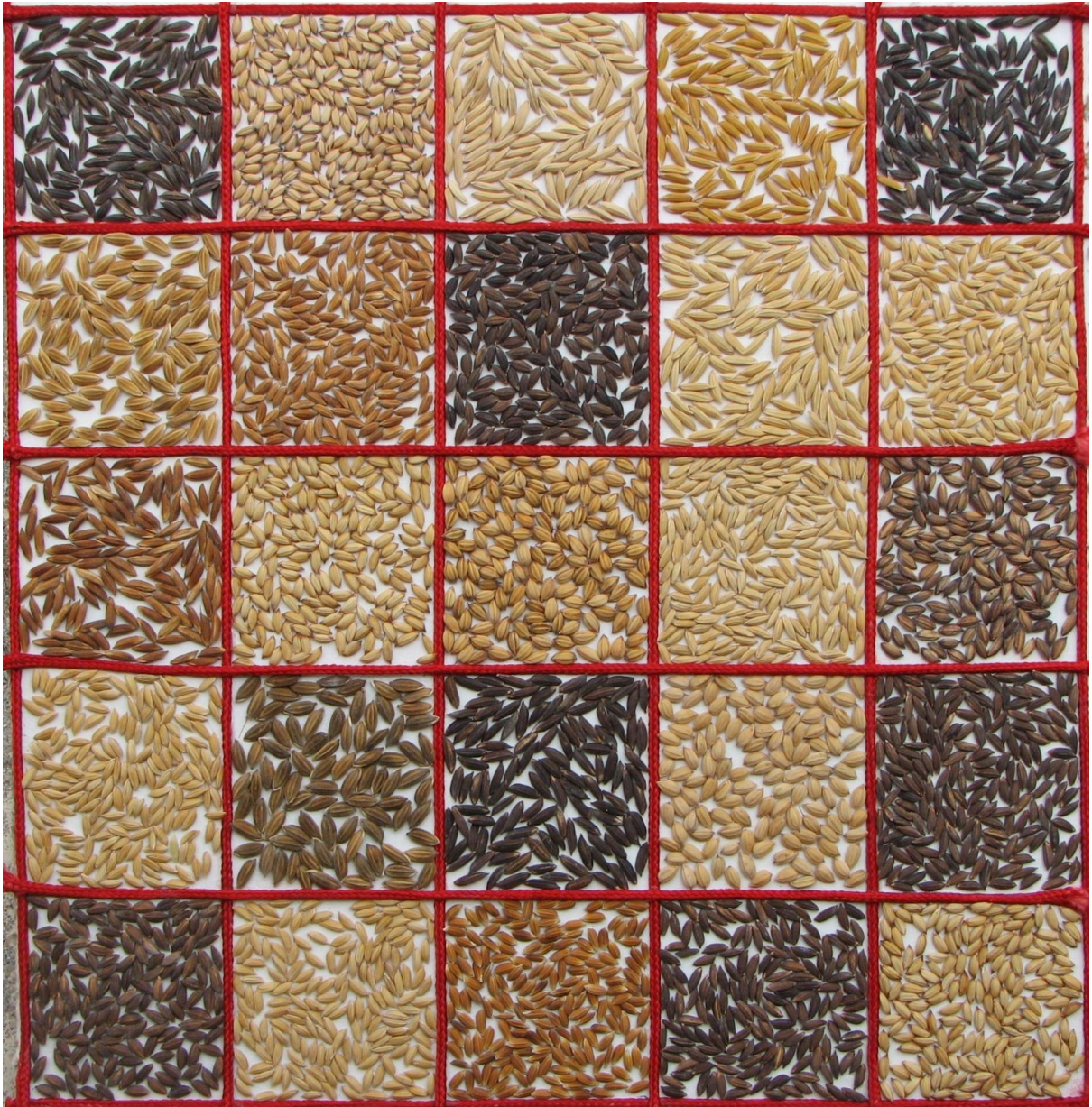
DIFFERENT TYPES OF RICE