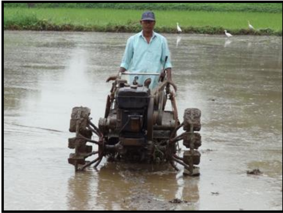
Paddling of rice field