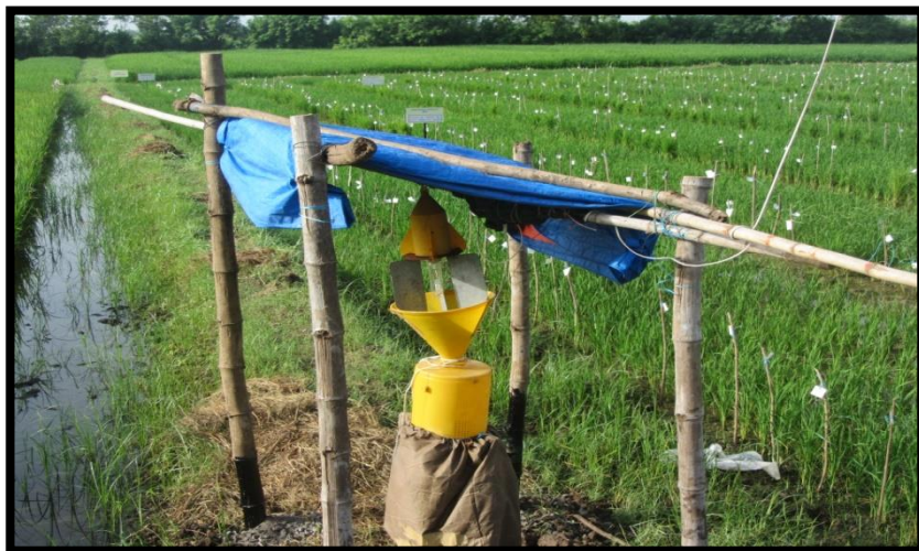
Plant Protection experiments at MRRC