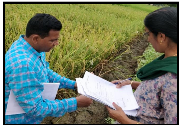
Monitoring team visit of AICRP, IIRR, Hyderabad