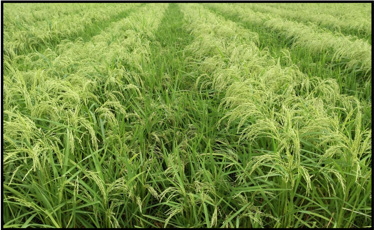
HYBRID RICE SEED PRODUCTION