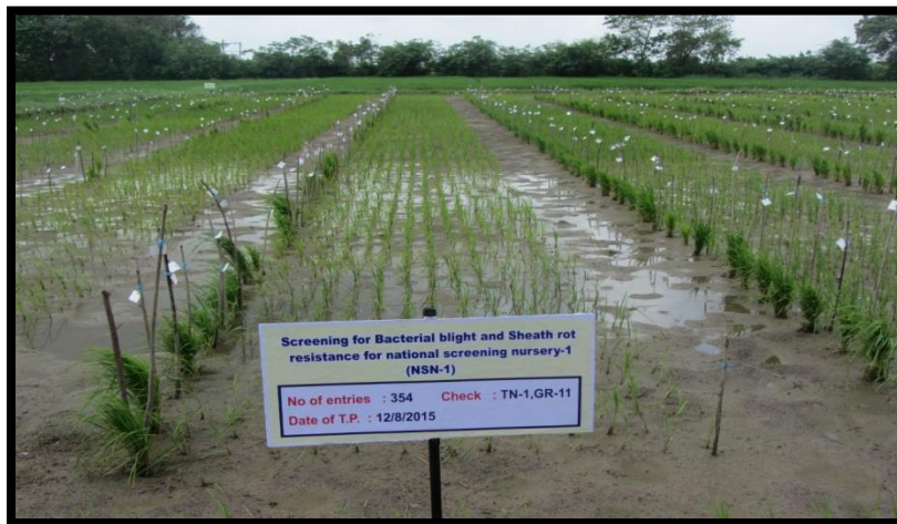
Field view of rice experiment