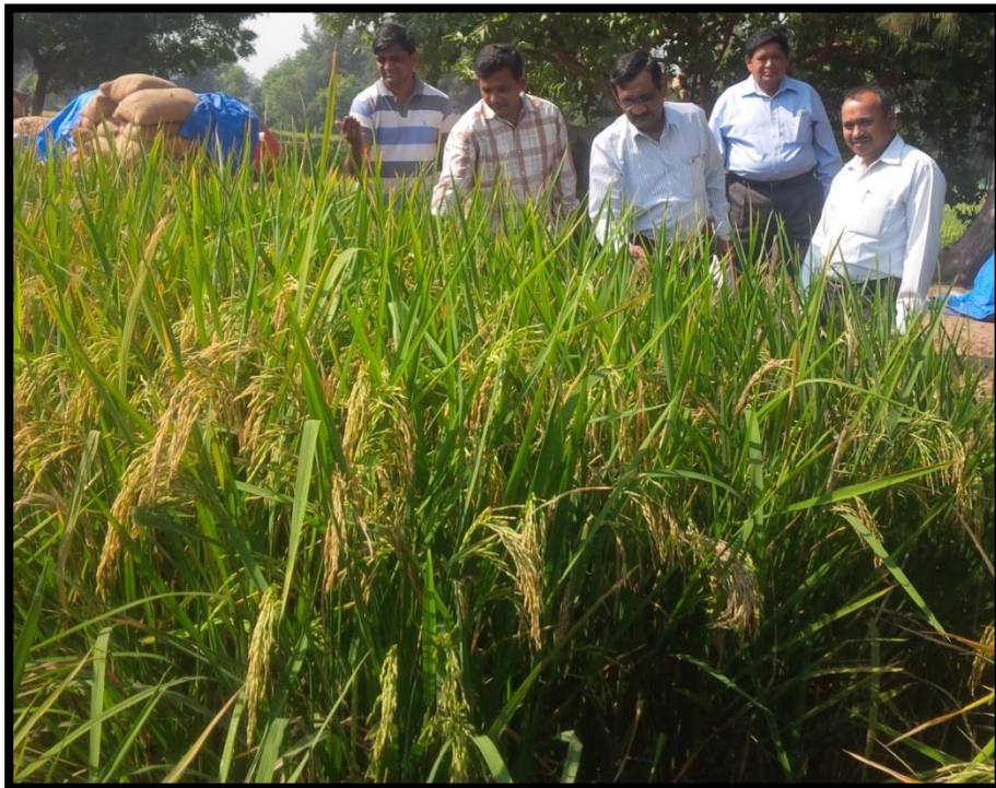
Field visit by Hon'ble vice chancellor