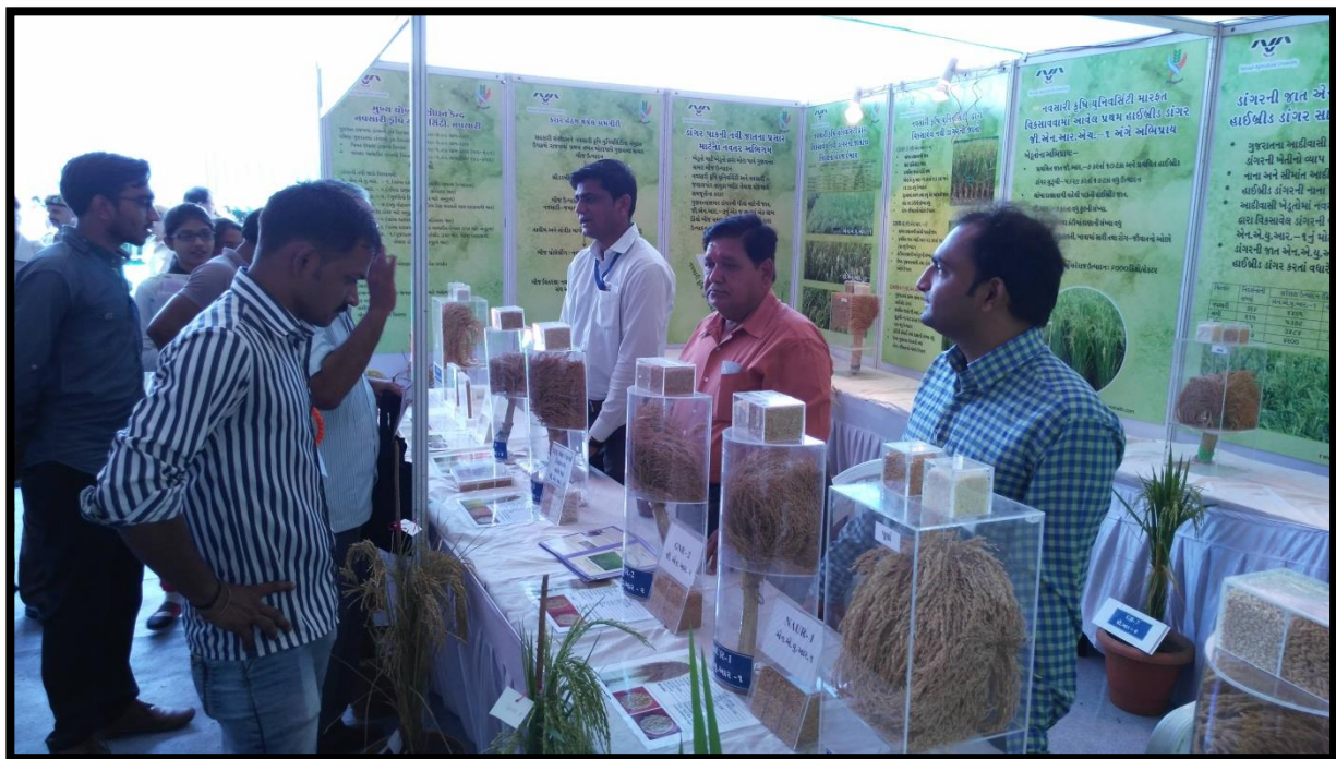
PARTICIPATION IN KRISHI MELA