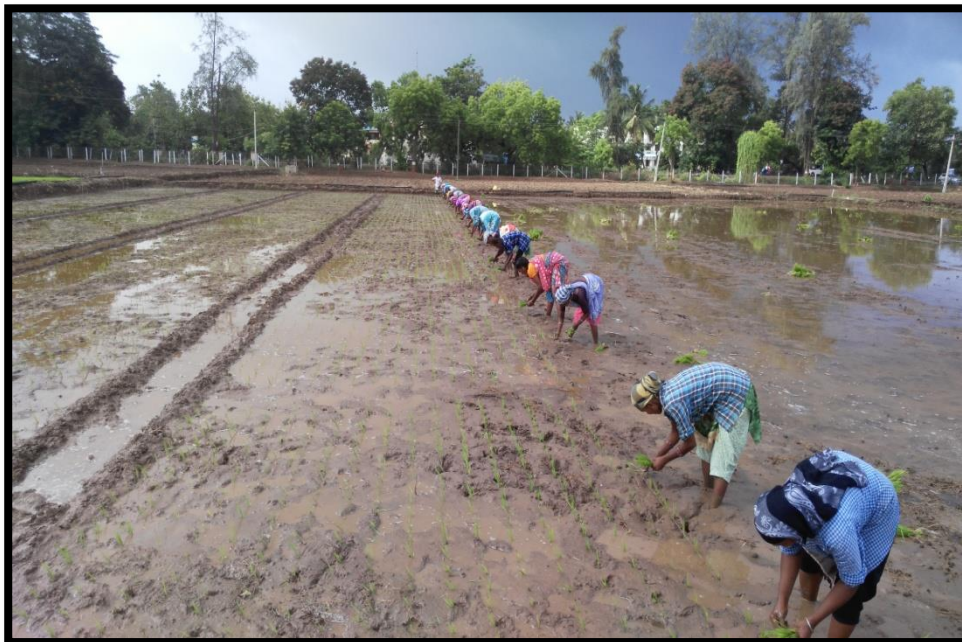
TRANSPLANTING OF RICE