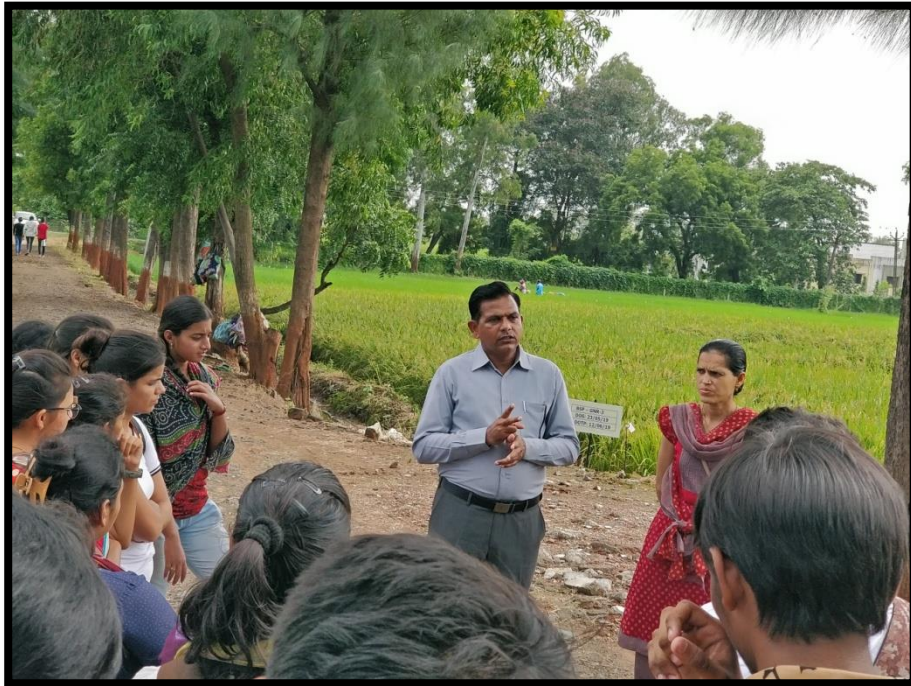
Interaction with students