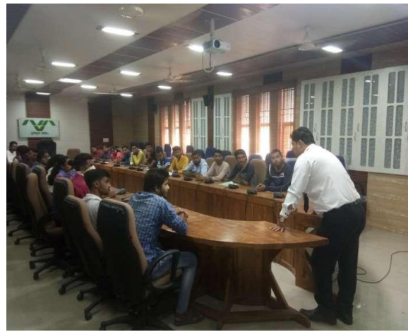
Special lecture cum short training on "Creative & Unique Competitive Exam Preparation Model"