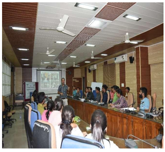
Glimpse of Day-long Technical Sessions of Campus to Corporate - C2C Training Programme -2023