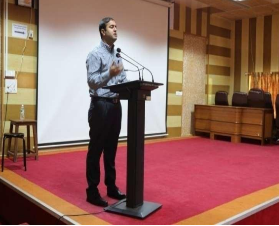
"Preparation for competative exams" by Shri Punit Nayyar"