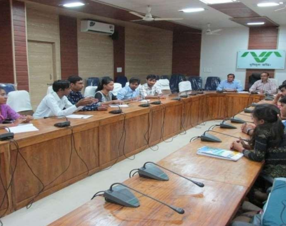
Group Discussion by PG students on "The System of Contemporary Agricultural Education in India"