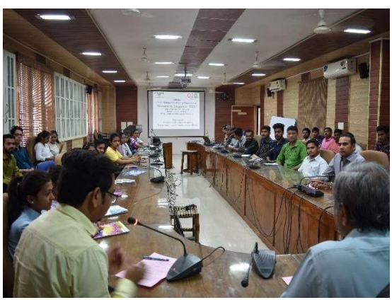
Glimpse of Campus to Corporate programme held recently