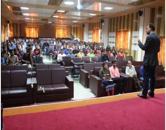
Full Day Career Management Training Programm "Campus to Corporate"