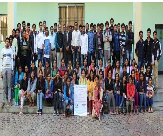
Participants of the Wrkshop