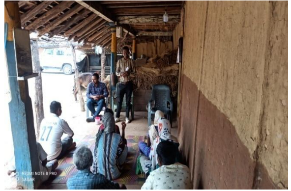
Cattle grooming, feeding & breeding