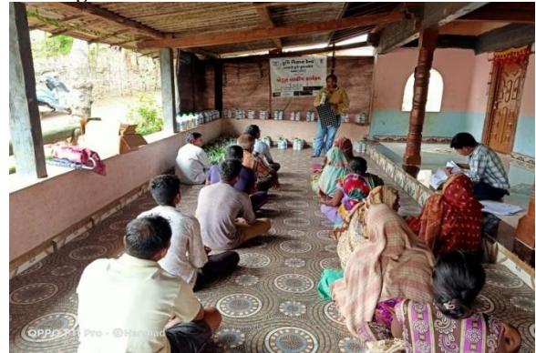
Seedling preparation in plug tray