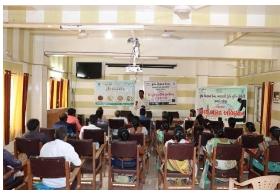
Scientific cultivation of Little millet