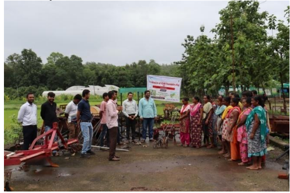
95 th ICAR Foundation Day