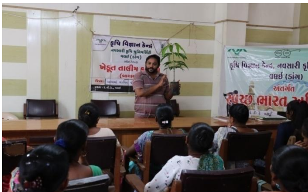
Integrated nutrition management in mango