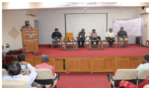
Farming for family consumption