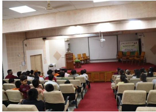
Farmer visit to KVK /Dignitaries visit to KVK