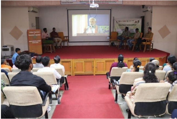
PM-KISAN SAMMAN program