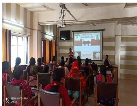
Nutrient deficiency in Okra