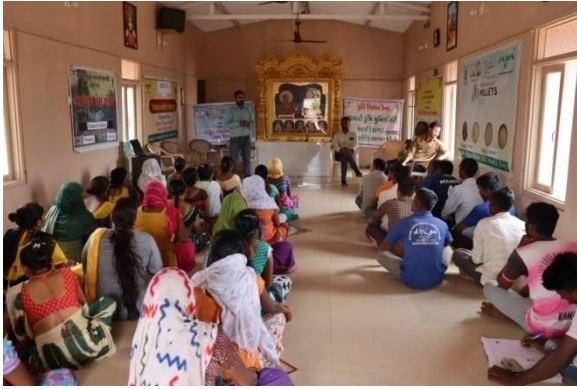
Rodents and their management