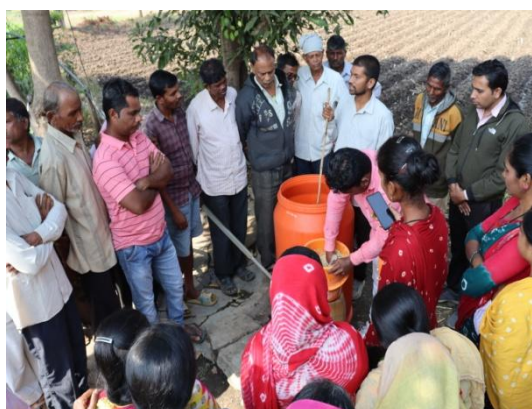
Nutrient deficiency in sorghum