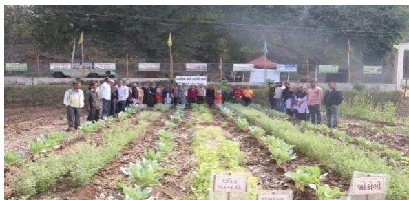
Nutrient management in gram