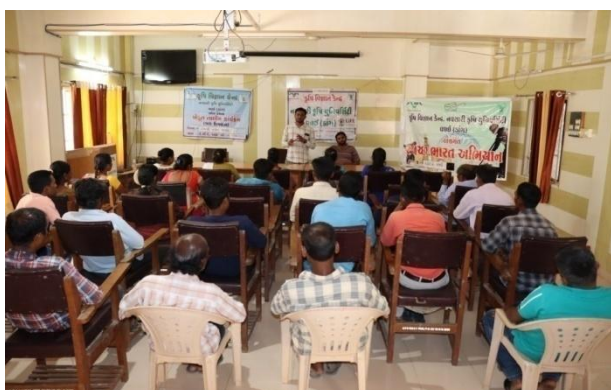
Sowing method of Paddy