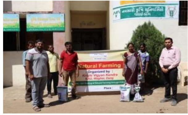
Method demonstration with title