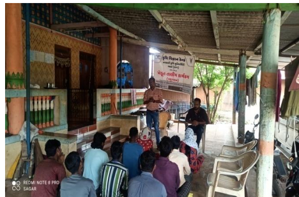
Importance of indigenous cattle in natural farming