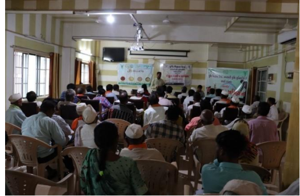
Pre sowing seed treatment to pulses