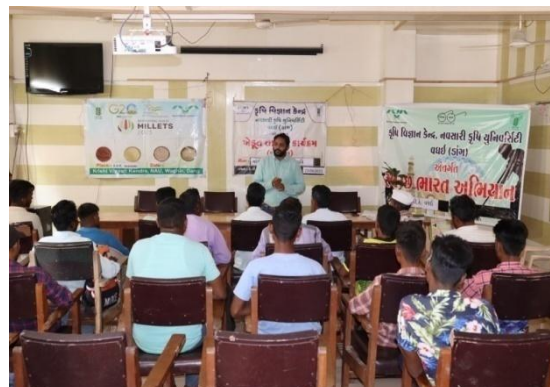
Scientific cultivation of chilli