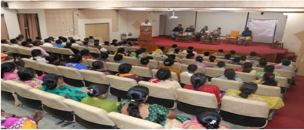
Workshop on Local ground water related issue & participatory ground water management