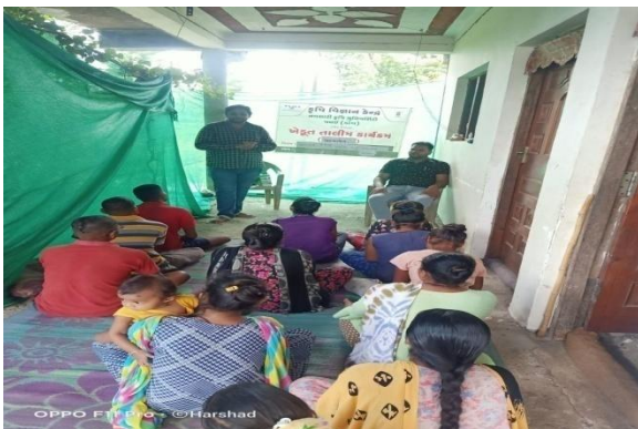
Application of natural farming in horticultural crops