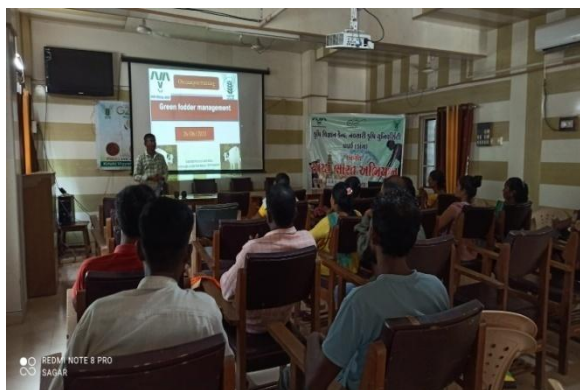
Green fodder management