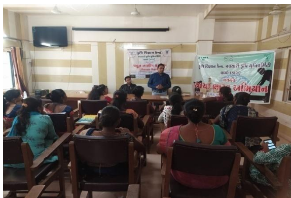
Importance of mass media in agriculture development