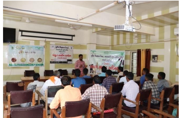
Scientific cultivation of Pigeon pea