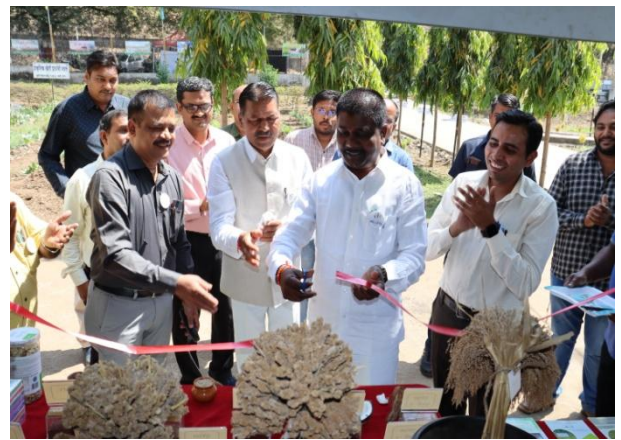
Inauguration of Millets corner