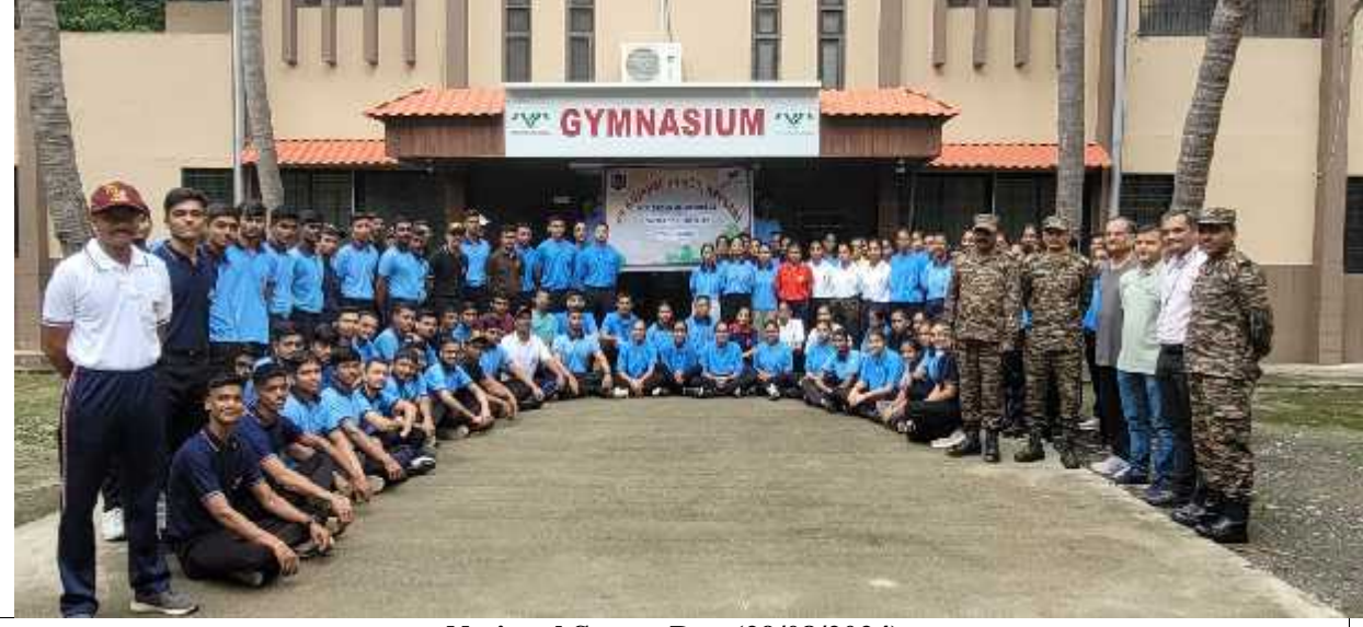
National Sports Day (29/08/2024)