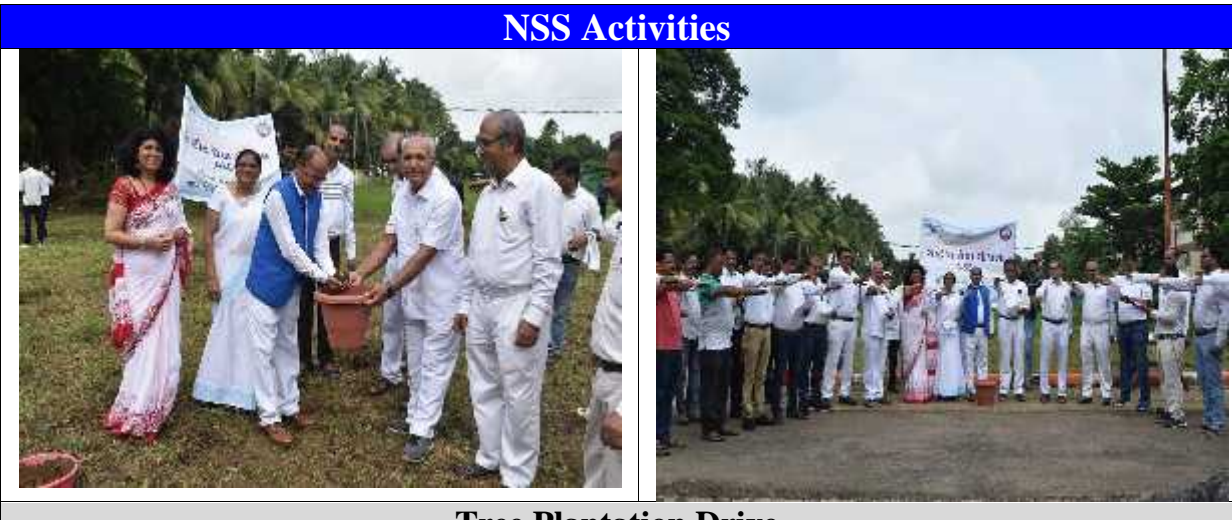
Tree Plantation Drive