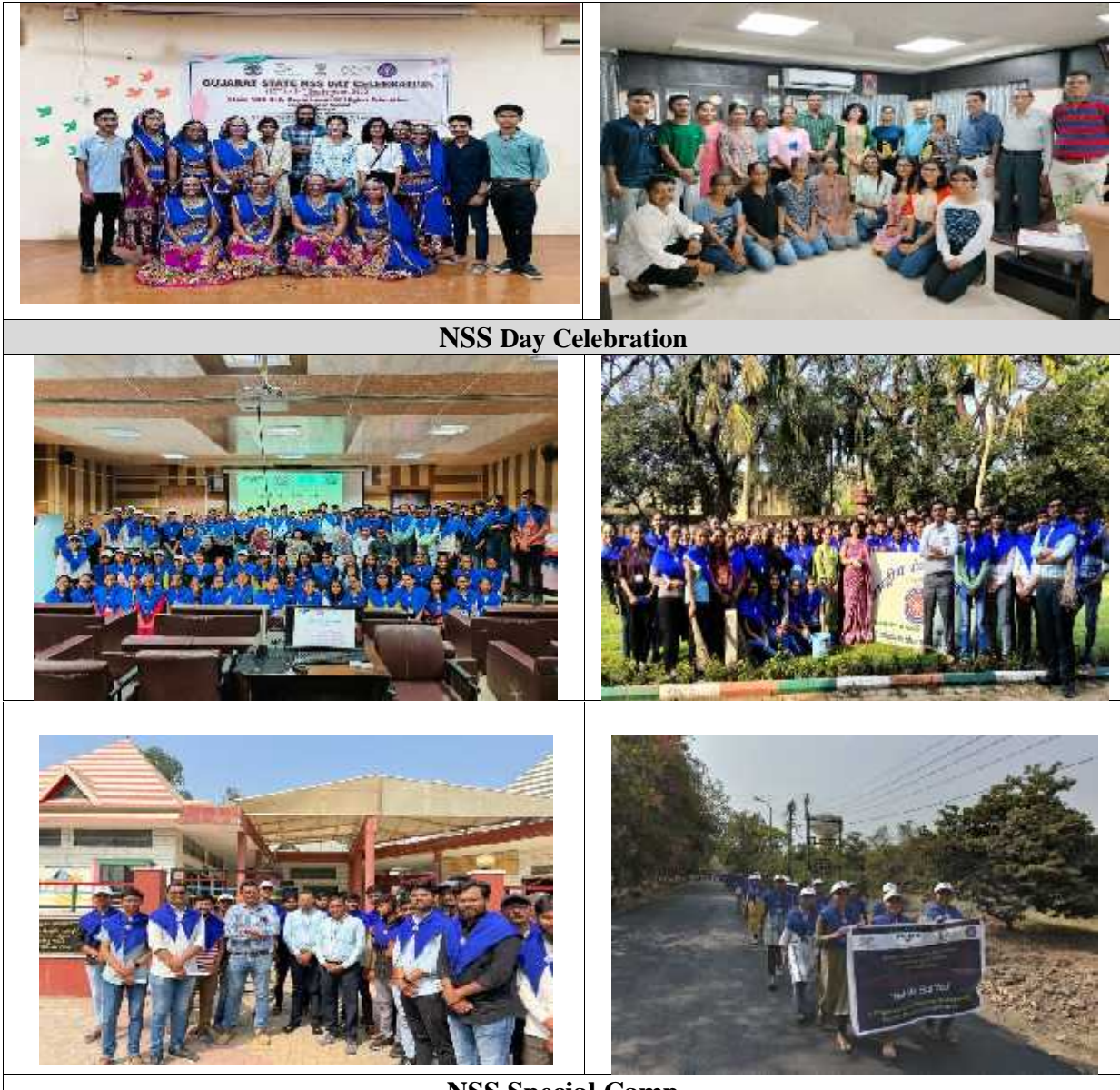
NSS Special Camp