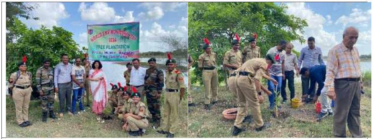
Tree Plantation drive on "World Environment Day" at Bhutsad Village (05/06/2024)