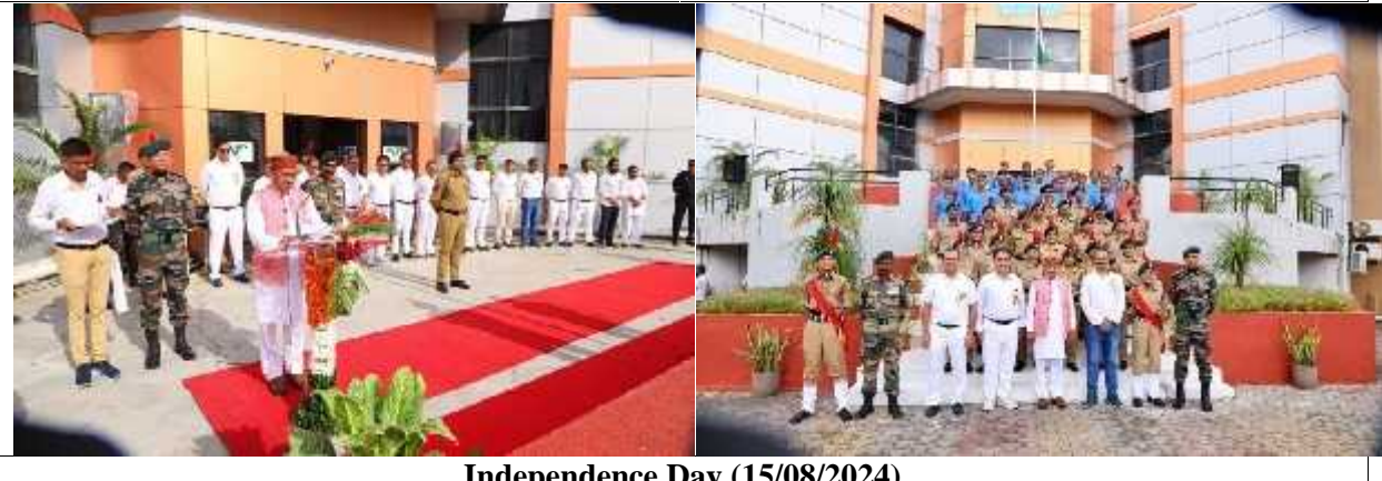
Independence Day (15/08/2024)