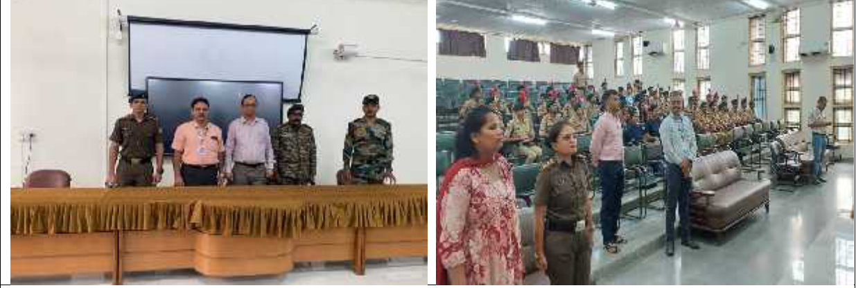
Kargil Vijay Divas (26/07/2024)