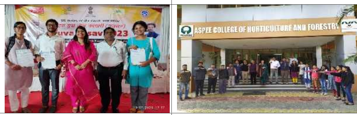
Nehru Yuva competition