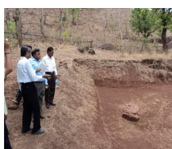
Small Farm Pond