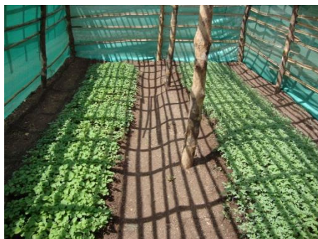
Nursery Raising in LCGH