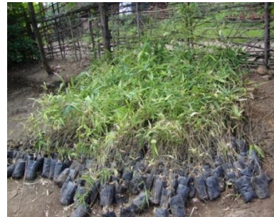
Planting of Vetiver grass and Bamboo saplings for soil erosion control