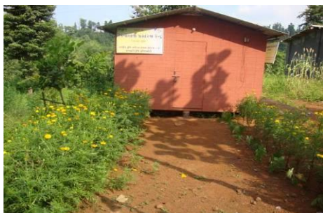
Technology Dissemination Center (TDC)