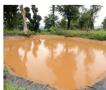
Harvested rain water