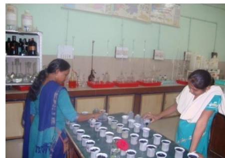
Soil Analysis in Laboratory