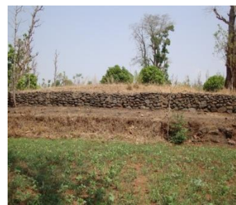
Soil conservation activity