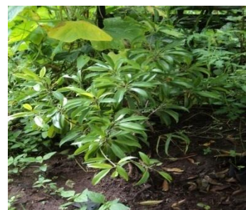
Plantation of Horticultural Plants