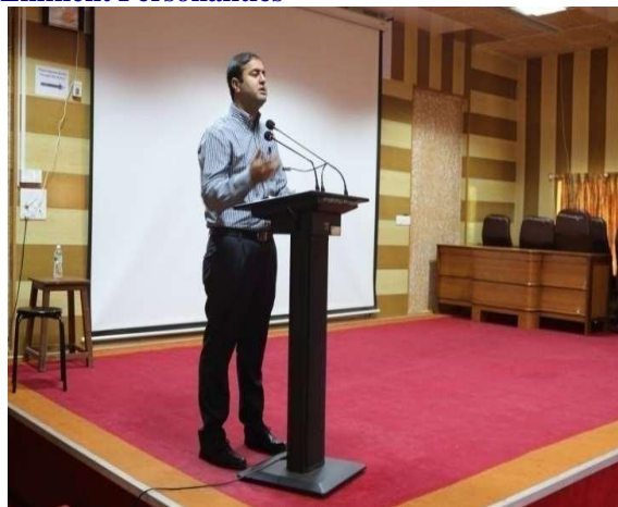
"Preparation for competitive exams" by Shri Punit Nayyar