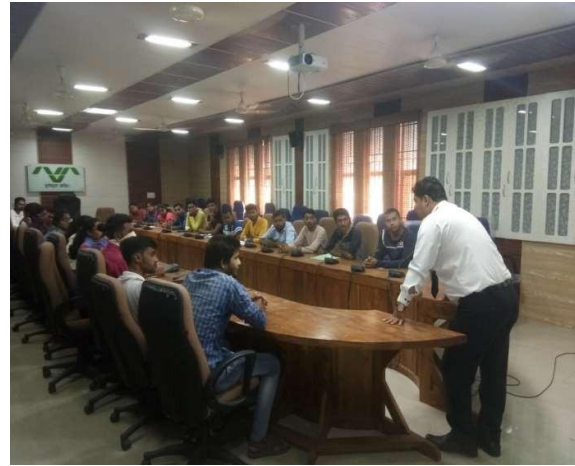
Special lecture cum short training on “Creative & Unique Competitive Exam Preparation Model”