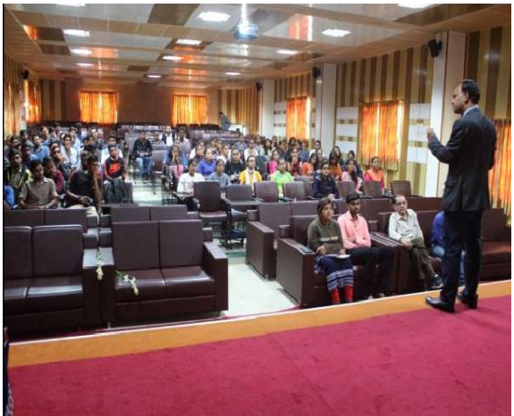
Full Day Career Management Training Program “Campus to Corporate”