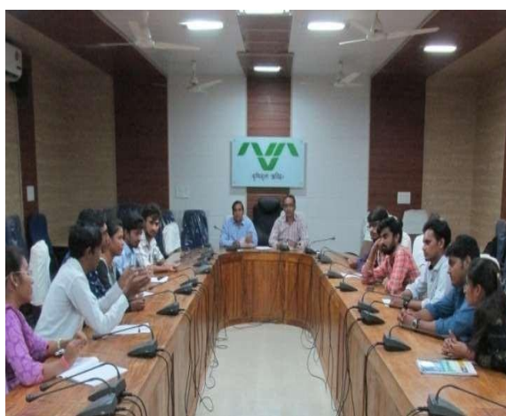
Group Discussion by PG students on "The System of Contemporary Agricultural Education in India"