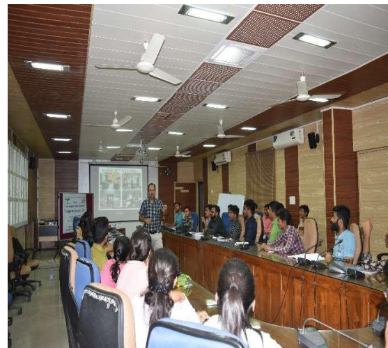
Glimpse of Day-long Technical Sessions of Campus to Corporate – C2C Training Programme -2023