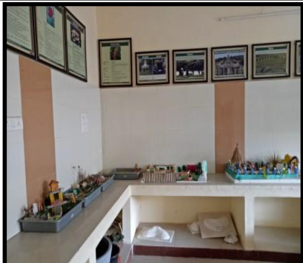
Floriculture & Landscape Architecture