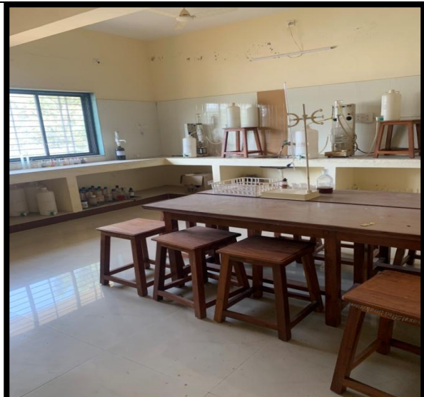
Agril. chemistry and Soil Science