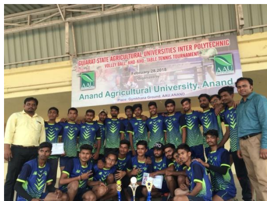
Champion Teams of Gujarat State SAUs Inter Polytechnic Volleyball, Kho-Kho & Table-Tennis Tournament