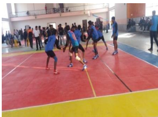
Participation in West Zone Kabaddi Men Tournament 2018