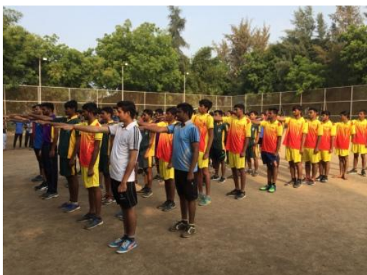
Inter-College Volleyball Men Tournament 2017-18