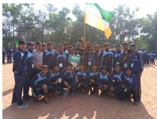
All India ICAR Sports Meet 2017-18