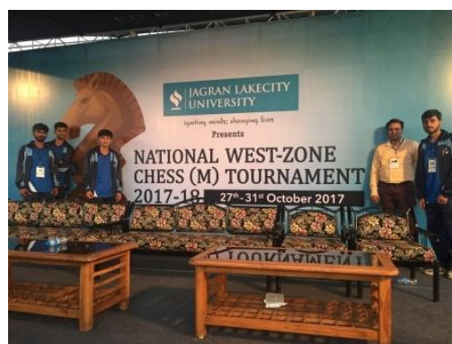
Participation in West Zone Chess Men Tournament 2018