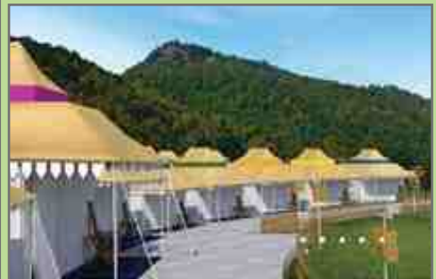
Statue of Unity and Tent City Narmada & Kevadia (175 km form Navsari)