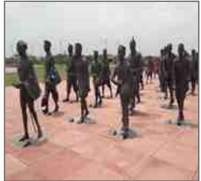
National Salt Satyagraha Memorial (UNESCO heritage site) Dandi (10 km from Navsari)