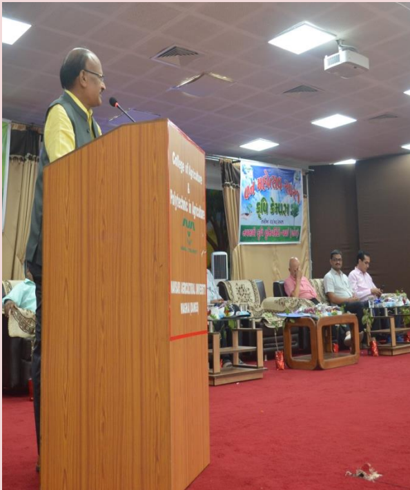
National Yoga day