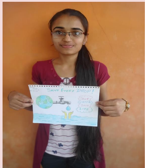
Kargil Vijay day & World Water day celebration