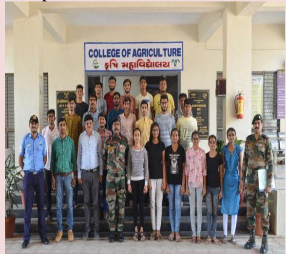
College visit of CO sir