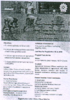
Poster for Labour Codes for agriculture-V003 (2).jpg 3866K