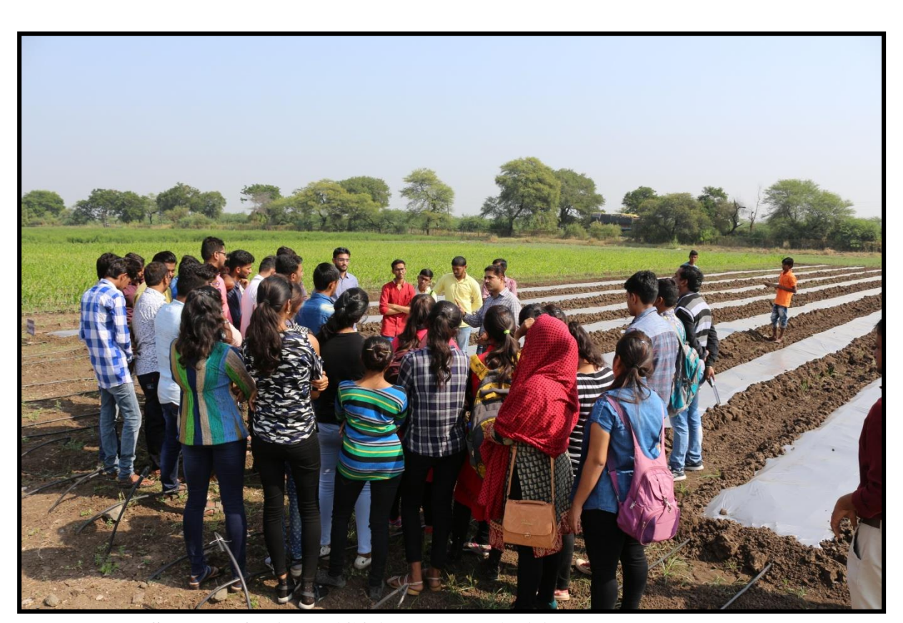
Student of RAWE (COAB, Bharuch) visited Tanchha center