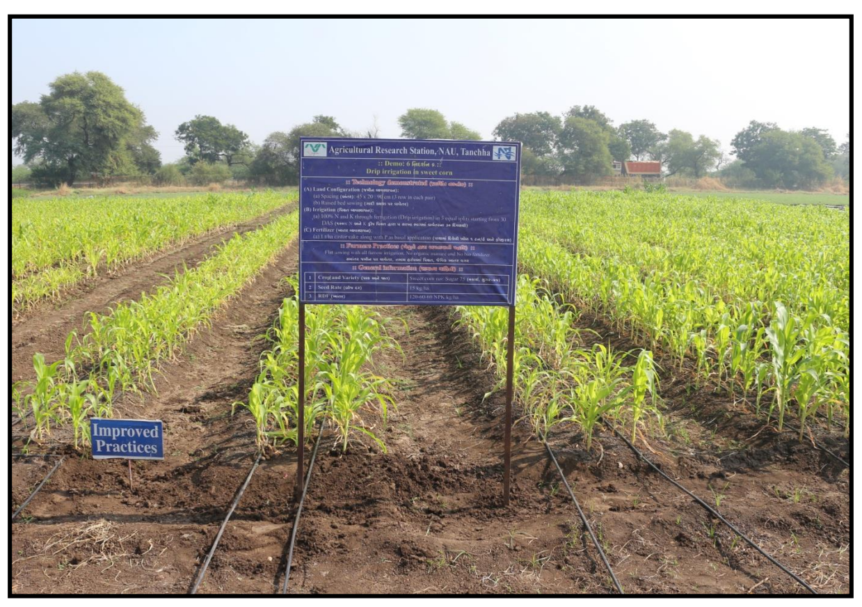
Demonstration of drip irrigation in maize under SSNNL, Gandhinagar funded project