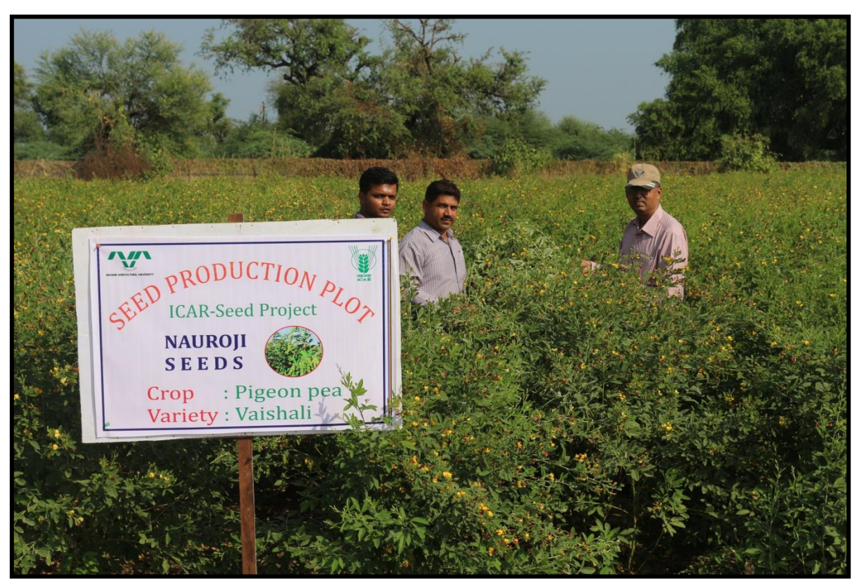
Pigeon pea seed production plot