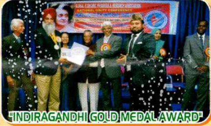
"INDIRAGANDHI (GOLD) MEDAL AWARD"