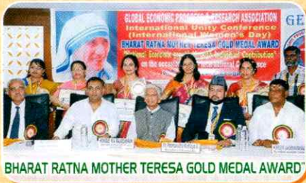
"BHARAT RATNA MOTHER TERESA GOLD MEDAL AWARD"