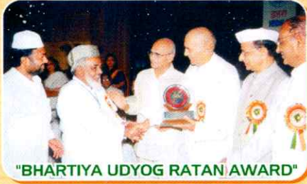
"BHARTIYA UDYOG RATAN AWARD"