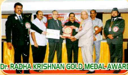
"Dr. RADHA KRISHNAN GOLD MEDAL AWARD"