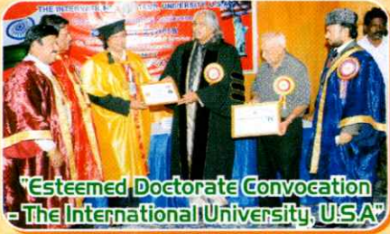
"Esteemed Doctorate Convocation - The International University, USA"