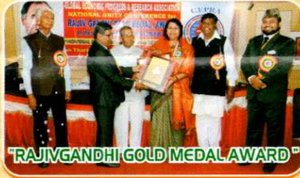
"RAJIVGANDHI GOLD MEDAL AWARD"