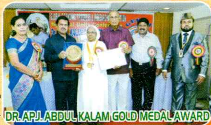
"DR. APJ. ABDUL KALAM GOLD MEDAL AWARD"