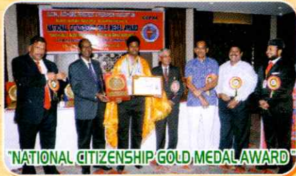
"NATIONAL CITIZENSHIP GOLD MEDAL AWARD"