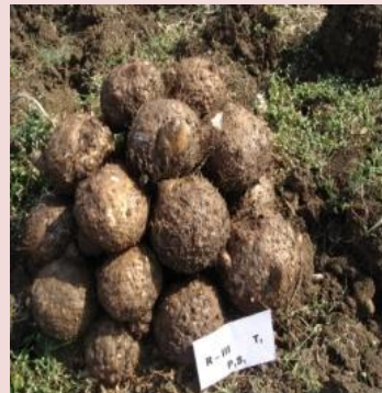
Yield from control sett