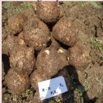
Yield from 250 g seed corm sett

The farmers of south Gujarat heavy rainfall agro-climatic zone growing elephant foot yam cv. Gajendra are advised to plant elephant foot yam at the distance of 60 cm × 60 cm by using seed corm sett of 250 g weight for obtaining higher BCR. By this way, farmers can obtain higher yield and save the cost of seed corm.