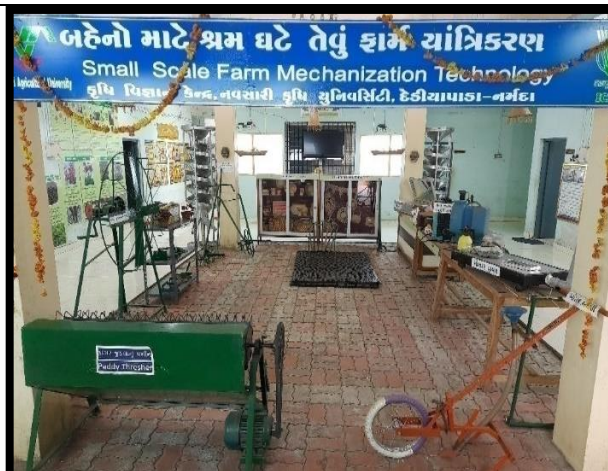
Small Scale Farm Mechanization