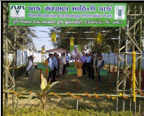
Plant Protection Park