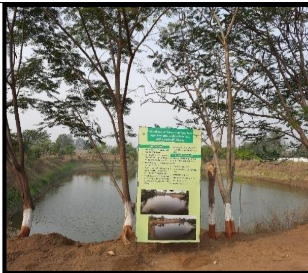
Water Harvesting Pond