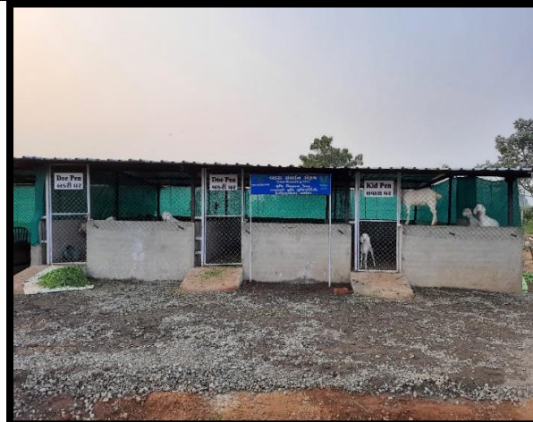
Goat Breeding Unit