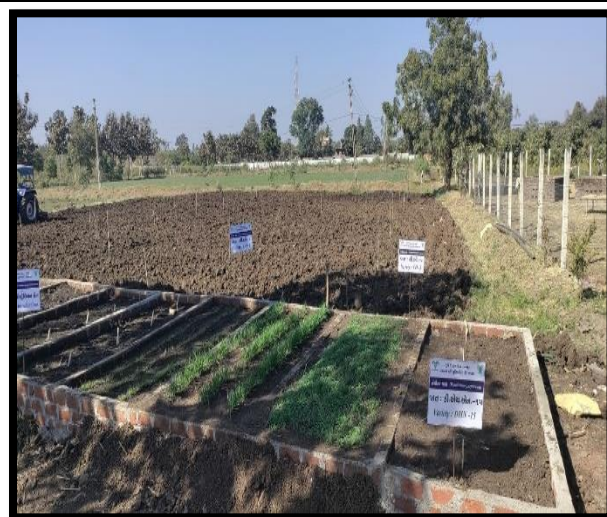
Fodder Crop Unit