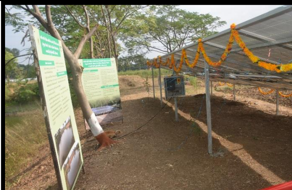
Solar Pump Unit