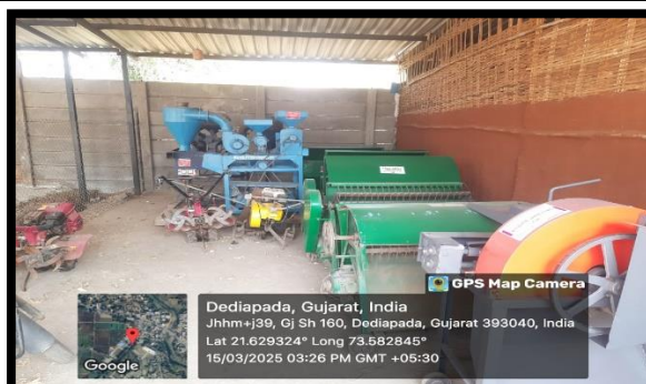
Custom Hiring Centre