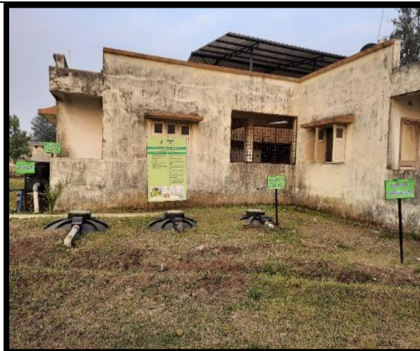
Roof Water Harvesting