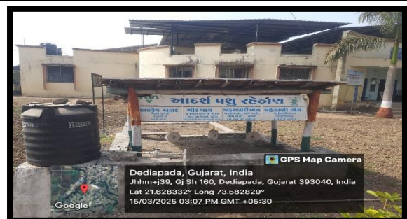
Ideal Animal Shed