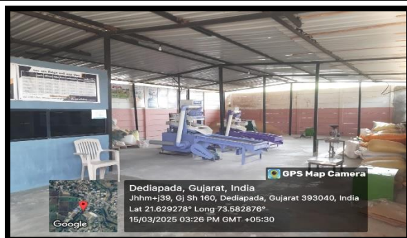
Millet Processing Unit