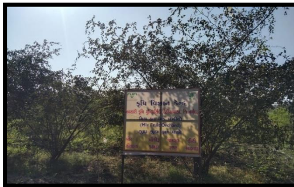
Mix Fruit Orchard