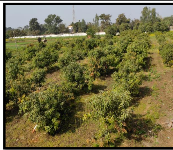
Mother Block Of Mango – 29 Var.