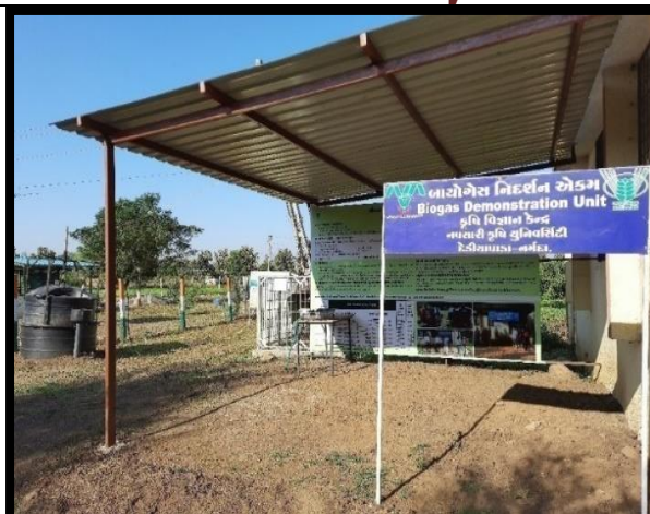
Bio gas Unit