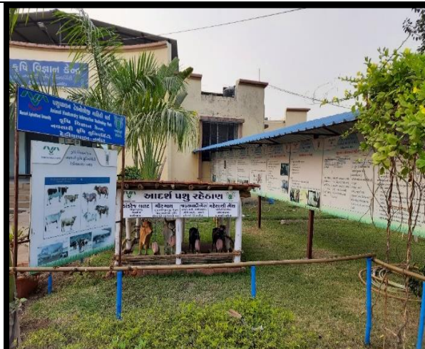
Animal Husbandry Park